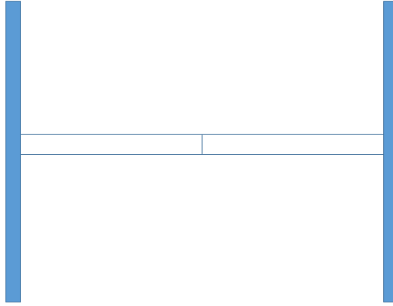
Figure 3: Ecastré beam as sum of two cantilevers.