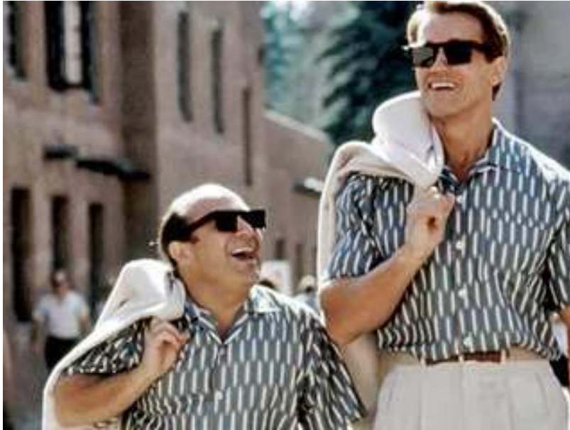
Figure 1: Fraternal (non-identical) twins (publicity still from 1988 film Twins ).

The use of the work ‘twin’ in the context of modelling is actually interesting semantically. Clearly the idea is to suggest a one-to-one relationship or identity between a structure and a model; however, this is unjustified if one refers to biology. According to recent statistics 2 , roughly one in 65 births results in twins; of these, the vast majority are fraternal - or non-identical twins (see Figure 1). Furthermore, opposite-sex twin pairs make up roughly 33% of fraternal twins. In fact, identical twins result from only one in 285 births, and even identical twins have distinct teeth marks and fingerprints. Finally, twins may look identical, but behave in completely different ways.