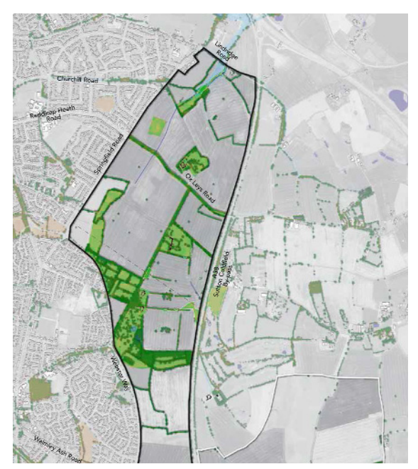
Fig. 3 Green infrastructure and assets at the Langley Sustainable Urban Extension, as set out in the draft SPD

From a broader city perspective, the learning from the case study can be seen spilling into other major developments through increased promotion of the integrated benefits of GI - addressing multiple agendas, and not drawn up in isolation from the desired outcomes from the overall vision of any scheme.