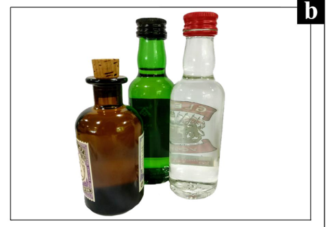
Figure 2. The zero measurement SORS spectra (a) of bottle glass from three commercial spirits drinks (b) vodka in clear glass bottle, gin in brown glass bottle, and Scotch whisky in green glass bottle. Resolve is a handheld SORS (through-barrier) device which takes two measurements, a zero and an offset. The difference between these is that the laser physically moves. The zero measurement can be thought of as traditional backscatter mode, with the Raman signal acquired being biased to the surface. So in the case of the glass bottles that we see here (b), it is generally just the fluorescence of the glass that is observed.

the loadings plots. Finally, an abridged dendrogram was constructed by performing hierarchical cluster analysis (HCA) on the principal component-discriminant function analysis (PC-DFA) scores (first 5 PCs, which typically account for > 99% total explained variance (TEV)) using Euclidean distance and average linkage (Fig. 1).