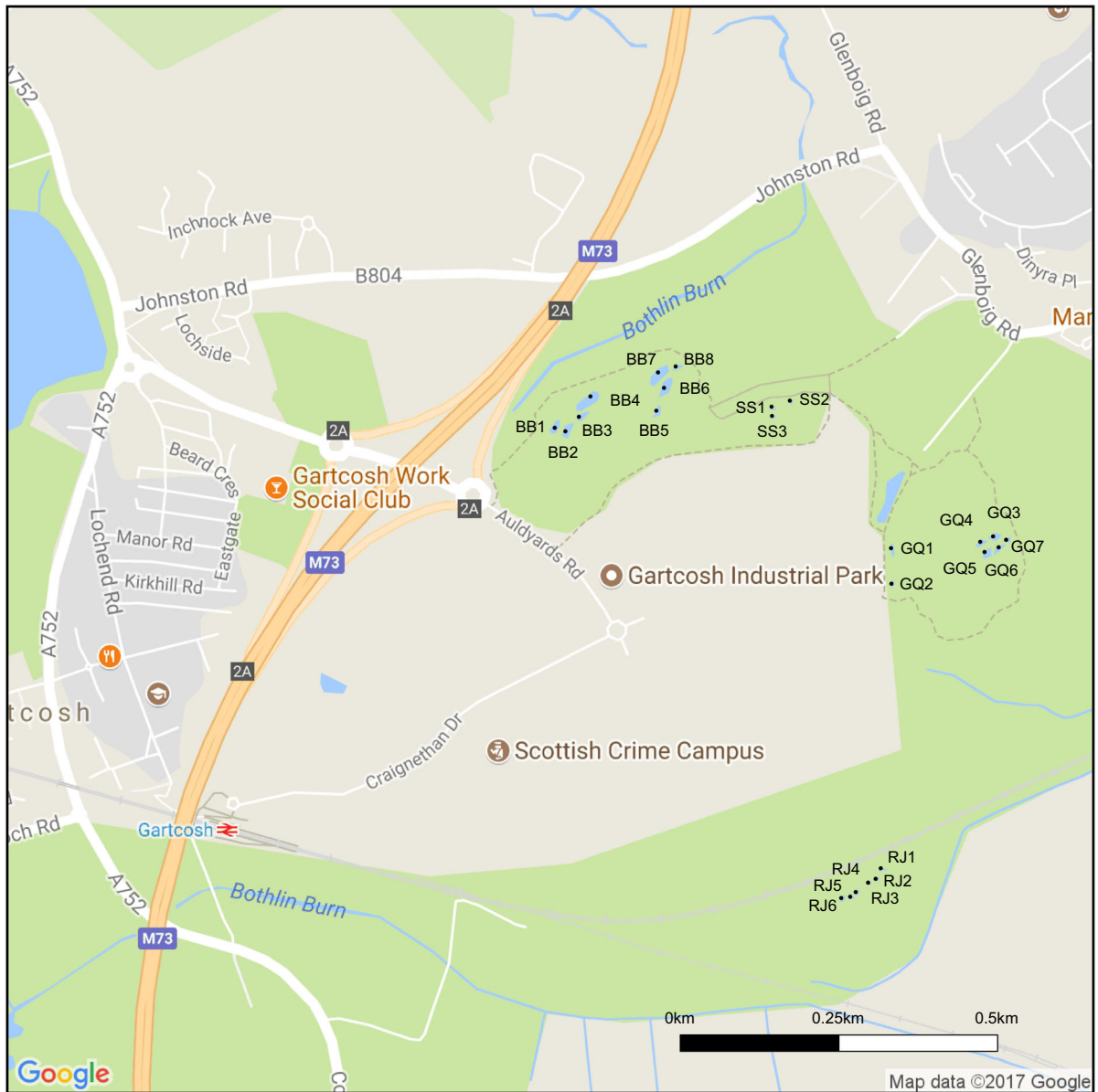
Fig. 1 Google Map of GNR showing all four zones: Bothlin Burn, Stepping Stone, Garnqueen Hill and Railway Junction. Bothlin Burn consists of eight ponds in two clusters (BB1–BB8), whereas Stepping Stone is a small cluster of three ponds

(SS1–SS3). Garnqueen Hill consists of seven ponds in two clusters (GQ1–GQ7) and Railway Junction consists of six ponds (RJ1–RJ6)