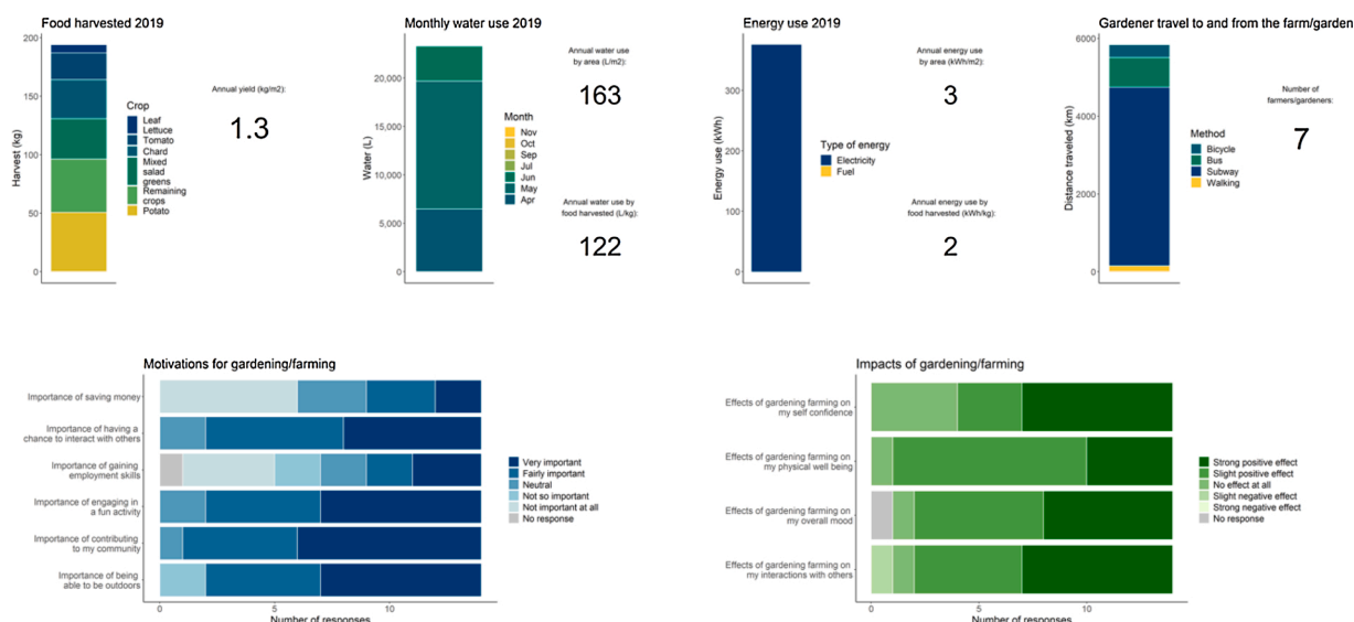
Fig. 3. Charts visualising harvest, resource consumption, motivations for gardening and positive impacts of this activity on the gardeners.

The case study illustrates the value and limitations of the FEWP framework. For example, we estimated that the project used 122 L of water and 3kwh of electricity per kg. of produce harvested, an