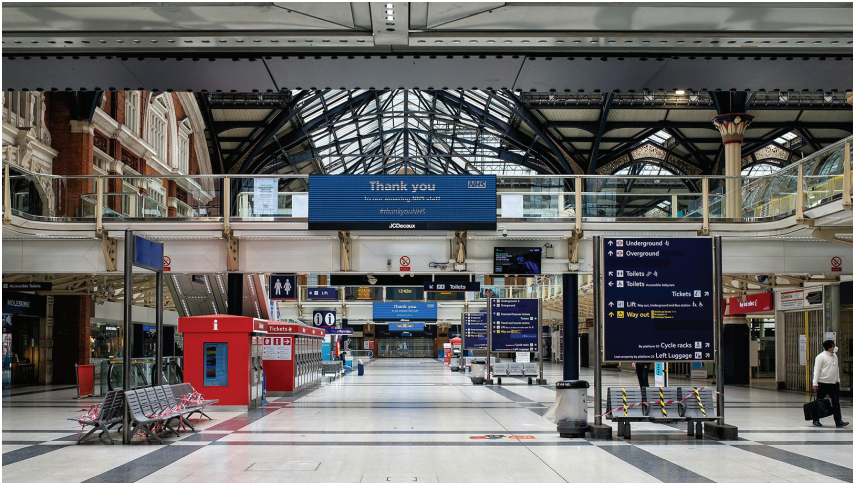
Photo: Liverpool Street Station, London.

The UK, Dutch and Swedish governments initially pursued the idea of promoting herd immunity, but the UK and Dutch have subsequently abandoned this strategy in light of mounting public concerns about the need to infect 60%-80% of the population and revised modelling, which indicated that health systems would be over-whelmed and this could not be pursued as a feasible public health policy [21]. Sweden is in contrast still broadly pursuing this approach with only minimal enforced restrictions on physical movements. Its case is however somewhat atypical as a large proportion of its population (~40%) live in single person households, it has a highly skilled workforce