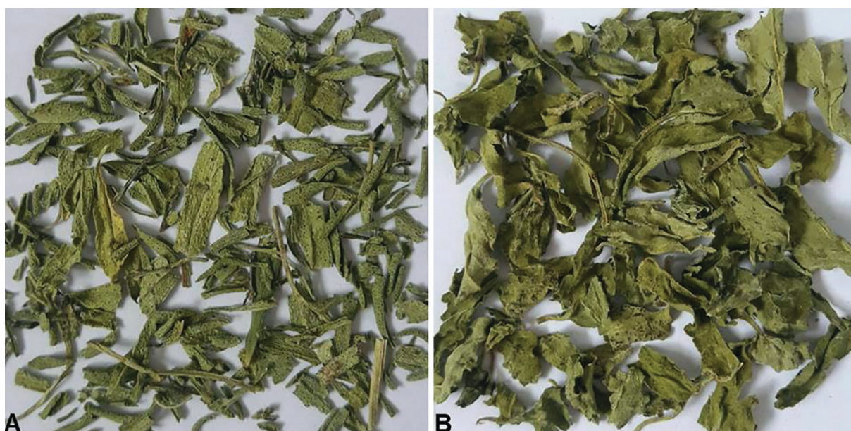
Figure 1: The morphology of S. khuzestanica (A) and Z. multiflora (B)

As described in table 1, the majority of the Iranian researchers collected the SKJ plants from Khuzestan and Lorestan provinces. Based