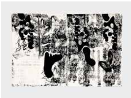
The water's full of Naked bodies swimming 2020 screen print, relief on birch wood 6x8 ft.