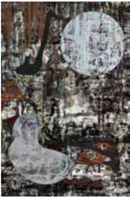
Reborn Norton 2020 ink, screen print, relief on canvas 9 x 14.2 ft.