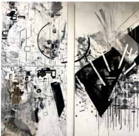
Where the dogs of society howl 2019 ink, mylar, acrylic, and paint on birch wood 6 x 6 ft.