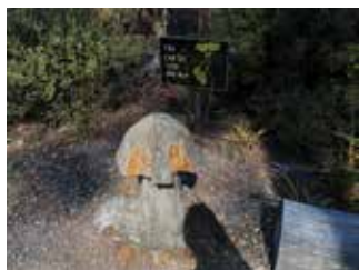
You can go your own way 2020 signage, photography