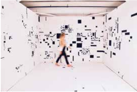
Will you teach me how to dance real slow 2019 Screen print and vinyl installation 36 sq ft.