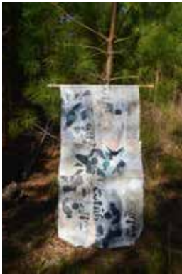
Ruined 2020 Screen print, relief, embroidery on canvas 5 x 7 ft.