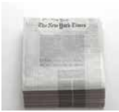
Extra! Extra! Read all about it! 2020 Newspaper and typography