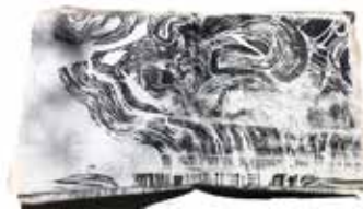
Be careful which way you Lean 2020 Relief, canvas, mulberry