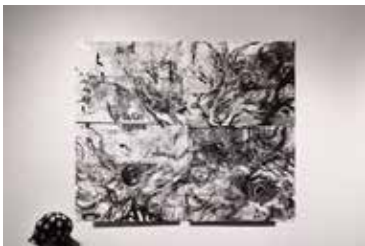
Put on your Red shoes 2020 Screen print, relief on birch wood 6 x 8 ft.