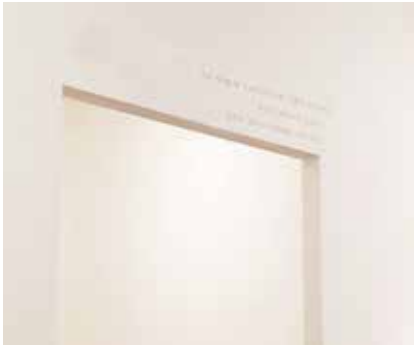
Sing about it 2020 vinyl installation