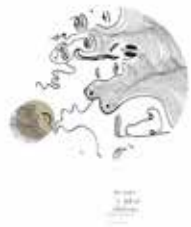
the Water's full 2020 book page 6 x 6 in.