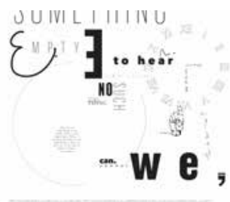
I'm listening, Mr. Eliot 2020 book page