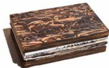
Language of the Trees II 2020 Perfect binding, newspaper, BFK, relief