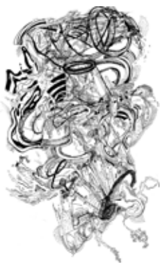
The blue of distance 2020 ink on french paper