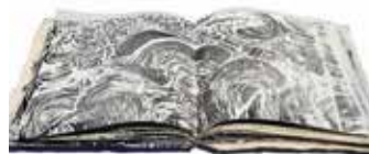
Be careful which way you Lean, detail 2020 Relief, canvas, mulberry