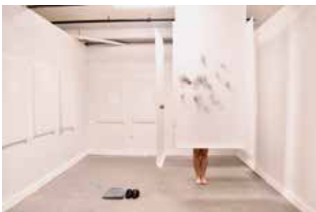
No one dared Disturb the Silence 2020 screen print on mylar, paper 36 sq ft.