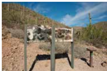
a slight irregular pause in the motion of a machine 2020 relief 22 x 30"