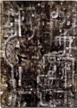
Burnt Norton 2020 ink, screen print, relief on canvas 8 x 14.2 ft.