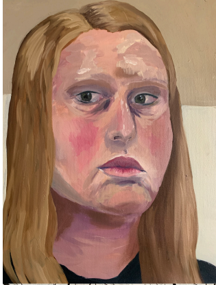
Painted Self Portrait , oil on canvas paper, 20"x 16", 2019