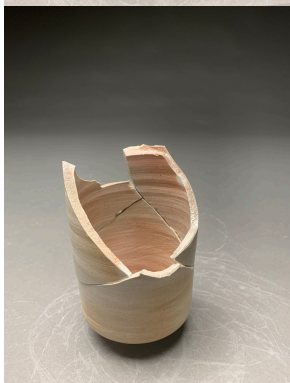
riley , ceramic, 6"x 4"x 4", 2019