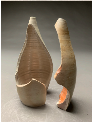
mitchell , ceramic, 9"x 6"x 6", 2019