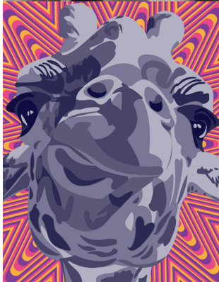
Giraffe , digital, 2018