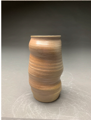
lambert , ceramic, 6.5"x 4"x 4", 2019