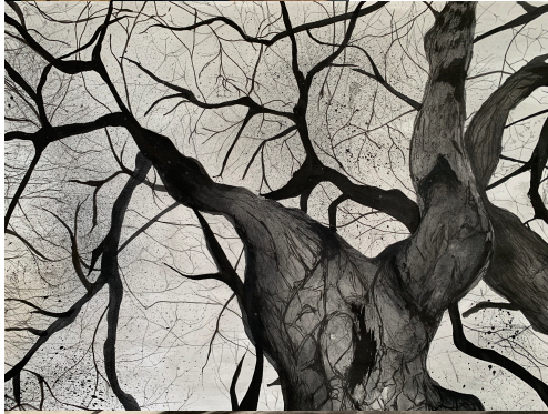
Overcast Tree , ink, 22"x 30", 2017