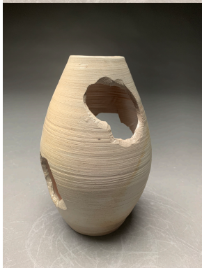
norris , ceramic, 8"x 5"x 5", 2019