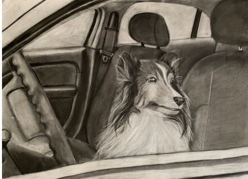
Prince , charcoal, 22"x 30" , 2017