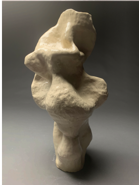
oatmeal , alternate view, ceramic, 24"x 12"x 9", 2019