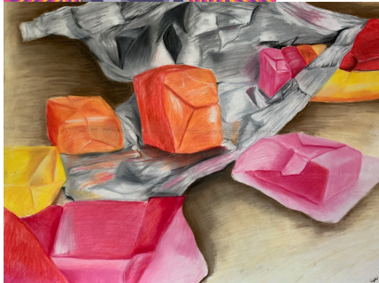
Starburst , chalk pastel, 22"x 30" , 2017