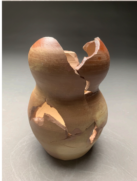
tabors , ceramic, 8"x 6"x 6", 2019