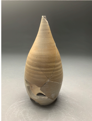
stephens , alternate view, ceramic, 11"x 5"x 5", 2019