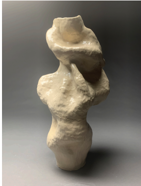
oatmeal , ceramic, 24"x 12"x 9", 2019