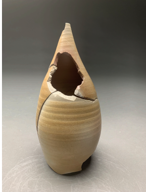
stephens , ceramic, 11"x 5"x 5", 2019