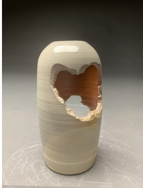
brookshire , ceramic, 7"x 4"x 4", 2019