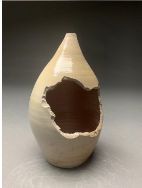
isbell , ceramic, 11"x 6"x 6", 2019