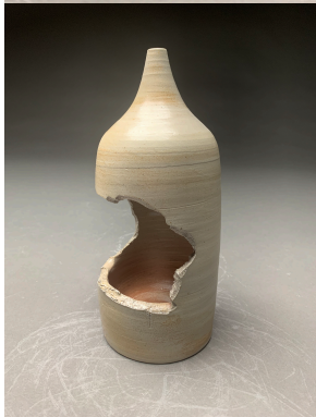
canter , ceramic, 10"x 4"x 4", 2019