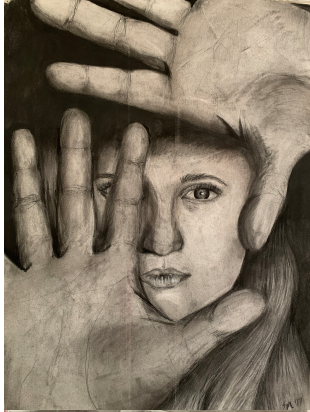
Psychological Self Portrait , charcoal, 22"x 30" , 2017