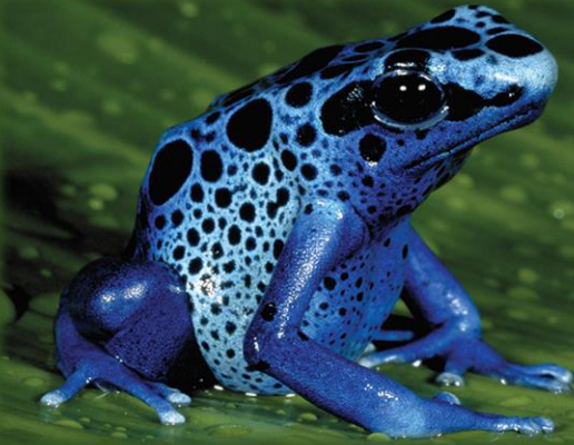
Fig. 1: Blue poison dart frog (National Aquarium, ND)