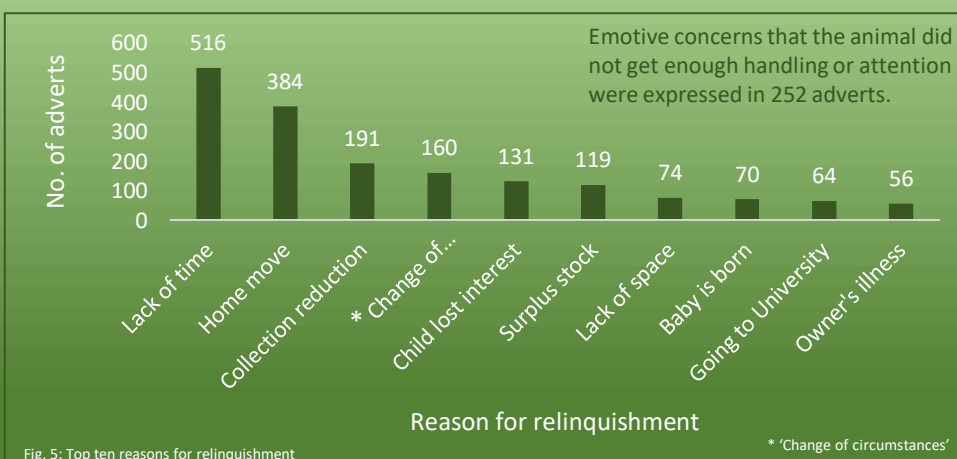
Fig. 5: Top ten reasons for relinquishment

Top 10 reasons stated for relinquishment (excluding commercial sellers) from classified website data during Aug 2017, Aug 2018, and Aug 2019 show 'lack of time' and 'home move' are common factors.