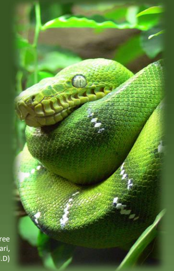
Fig. 3: green tree python (Manokwari, N.D)