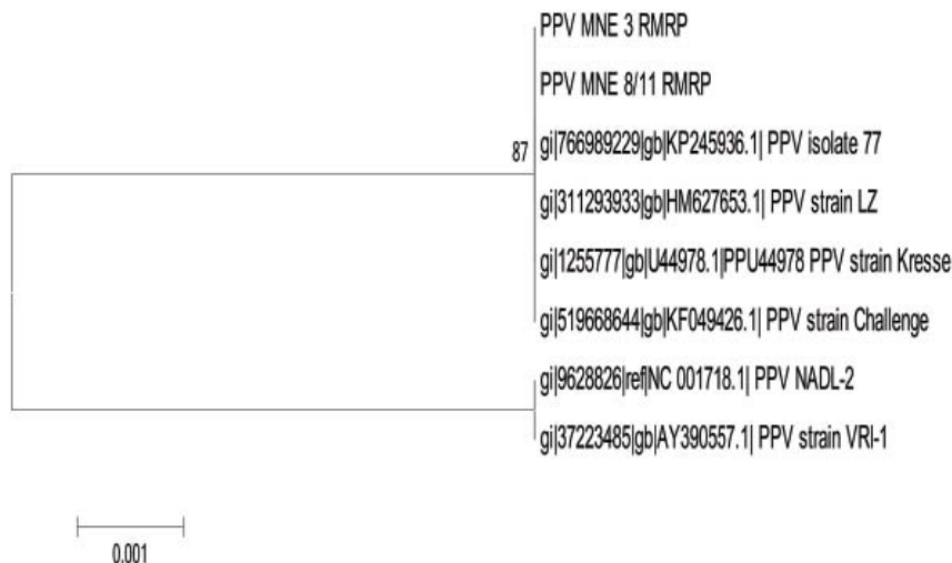
Figure 2. Evolutionary relationships of PPV Evolutionary analyses were conducted in MEGA 6 software. The tree was constructed using Neighbor Joining algorithm with 1000 bootstrap replicates. The evolutionary distances were computed using Maximum Composite Likelihood method.