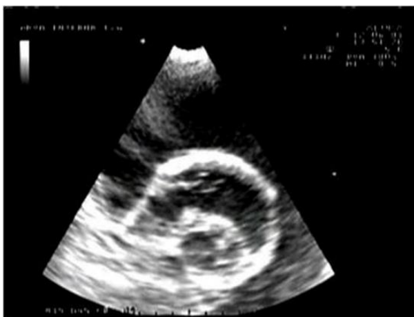
Fig. 2. Echocardiogram of a dog with strong hydro pericardium and clearly visible adult forms of Dirofilaria in the lumen of the right ventricle and pulmonary artery - Caval syndrome (Echo 0)

The examined electrocardiograms mainly revealed physiological values, while a small number of patients showed sinus rhythm tachycardia. A shift of the electrical axis to the right was observed in 41.17% of dogs (14/34). Of 10 dogs which had irregularities on the first echo examination, four expressed AV-block II degree, which constituted 71.42% of the total number of dogs with ECG changes detected, and two dogs had atrial fibrillations, which was 35.71% of the total number of dogs in which ECG changes were observed.