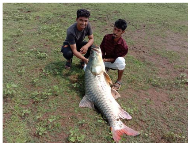
FIGURE 1 Youths with a Critically Endangered hump-backed mahseer, Tor remadevii , caught from the Harangi Reservoir in Kodagu, Karnataka, India

symbolic of India's extraordinarily diverse aquatic life. There is increasing evidence that their last remaining giant specimens are being removed from South India's River Cauvery by illegal fishers using a variety of capture methods (Deccan Herald, 2020), pushing them a step closer to extinction. This demonstrates that to understand fully