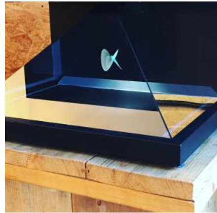
Figure 4: Oliver Gingrich 'Ghost in the Machine' Hologram

effects practices, methods and techniques, innovations and technical developments. Furthermore, we are looking to provide a deeper understanding of animation as a career path, as an applied art form, with a multitude of different fields of engagement such as gaming, medicine, 3D printing and heritage conservation and many more.