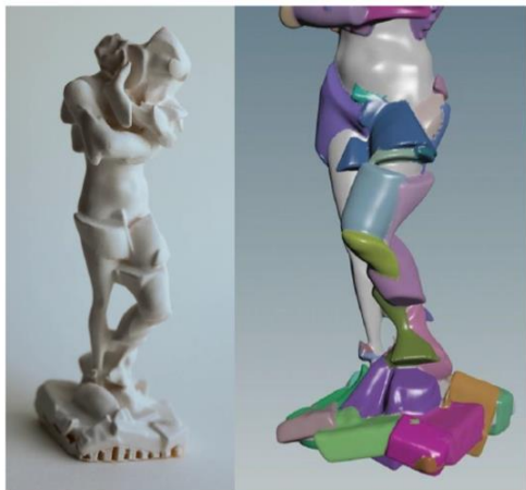
Figure 3: Valery Adzhiev 3D 4D cubism project 'Eve'

Importantly, the exhibition will serve as a platform to launch the new NCCA archive, a collection of storyboards, concept boards and artefacts donated to the research centre by world leading companies such as Aardman, CBBC, and Blue Zoo, as well as NCCA graduates and alumni.