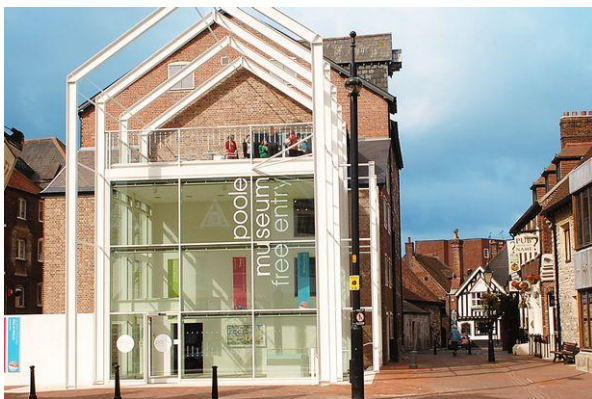
Figure 1: Poole Museum - the most popular free attraction in Dorset

The NCCA continues its excellent reputation through its presence at the world's foremost forums for computer graphics discourse such as Siggraph (Comninos et al. 2010), Eurographics and the creation and running an internationally renowned festival for animation and visual effects. The BFX Festival is known as the UK's largest festival for animation and visual effects.