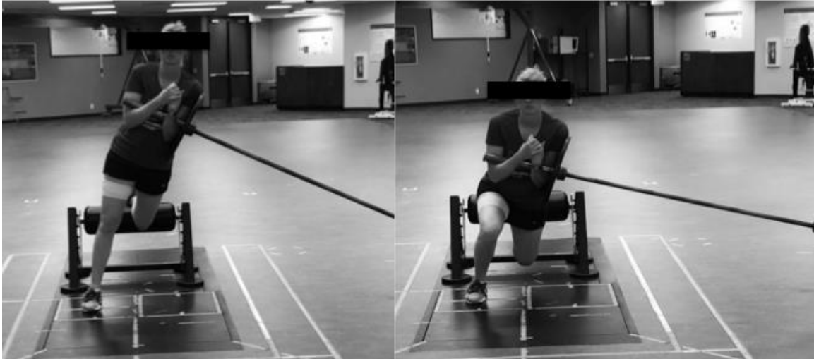
Figure 1 Laterally resisted split squat