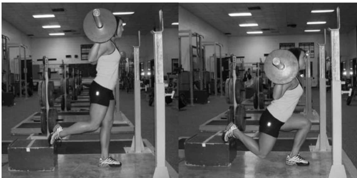
Figure 2 Modified single leg squat 18

17.7 mV; hamstrings: 24.4 \pm 10.6 mV) and stiff-legged deadlift (gluteus maximus: 40.5 \pm 18.8 mV; hamstrings: 29.9 \pm 12.5 mV). 17 McCurdy et al explained the greater activation in the gluteus maximus and hamstring muscles, compared to other studies, may be due to previous studies using body-weight resistance or light loads during exercises compared to this study using higher relative intensities of 8 RM. 17 The MSLS shows promise to improve COD performance as it activates the specific muscles used during COD and is performed in a unilateral fashion.