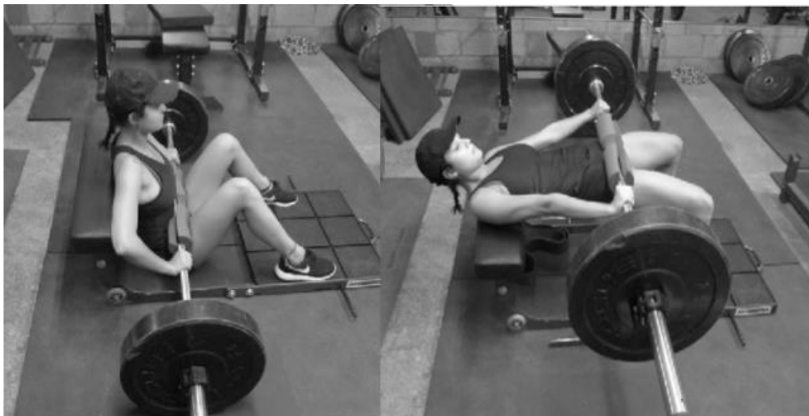
Figure 3 Barbell hip thrust 5

Loturco et al also applied the force vector theory. 13 They calculated the correlation between performance outcomes of the barbell hip-thrust, half-squat, and vertical jump to performance outcomes in the different phases of sprinting. 13 When an elite sprinter comes off a block at the start of the race, they accelerate in the horizontal plane for the first 50 meters as they keep their bodies parallel to the ground and gradually transition to a vertical upright position. Because of the different planes and positions used when sprinting, Loturco et al hypothesized that athletes that have a stronger barbell hip-thrust will have a faster velocity in the first 50 meters of a 150-meter sprint, while athletes who have greater half-squats, weighted jump squats, squat jumps, and countermovement jumps will have a higher velocity in the later stage of a sprint. 13 Sixteen elite (Olympic, world championship, or national level) sprinters and jumpers (9 males; 7 females) participated in this study. Day one consisted of five trials of two forms of the vertical jump (squat jump and countermovement jump) with the highest jump used for analyses. They then performed two 60-meter sprints with cameras set at 0 meters, 10