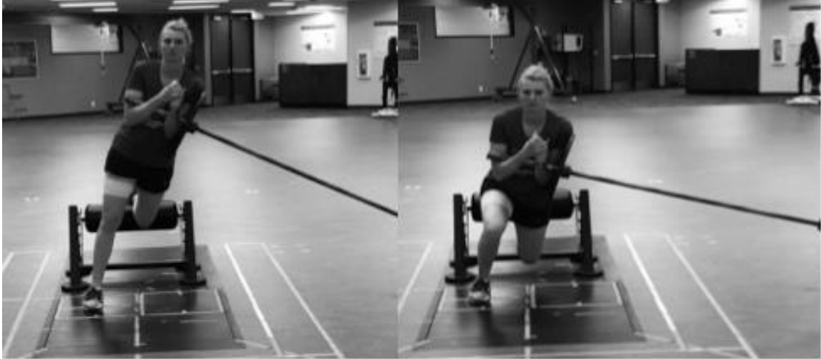
Figure 4 Laterally resisted split squat

The purpose of this study was to determine if the LRSS more closely mimics both the movement plane and angle of force production of the COD than the MSLS and BS movements. It was hypothesized that the LRSS would result in a peak GRF magnitude and angle that is not statistically different than COD, but significantly different than the BS and MSLS, respectively.