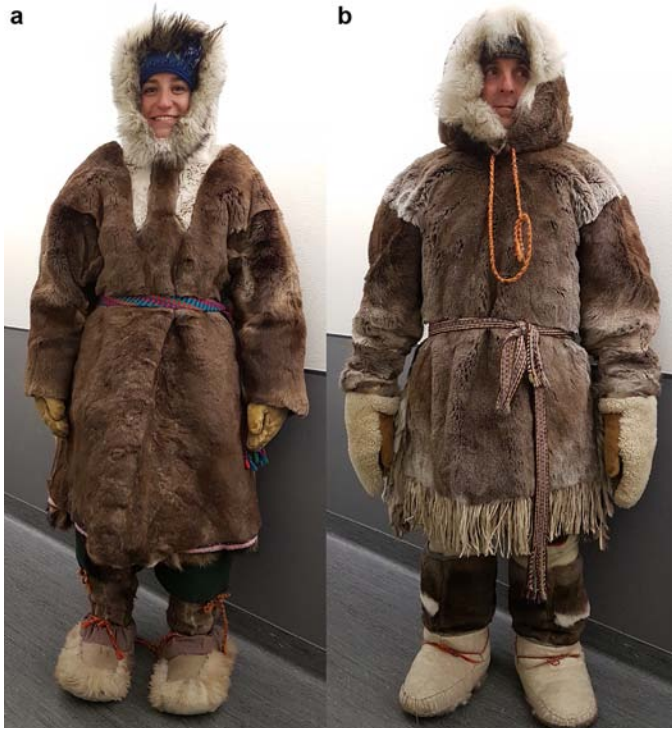
FIG. 1. Subjects wearing the two caribou-skin outfits. Subject 1 (a). Subject 2 (b). Each subject was similar in gender, height, weight, and body form to the individual for whom the outfit was made.