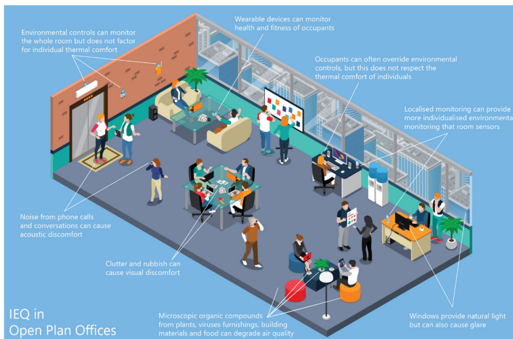
Figure 2. In Open Plan Offices.