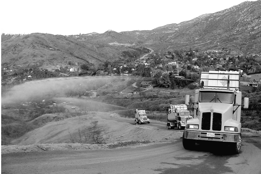
Figure 5. Hydraulic mulch application.