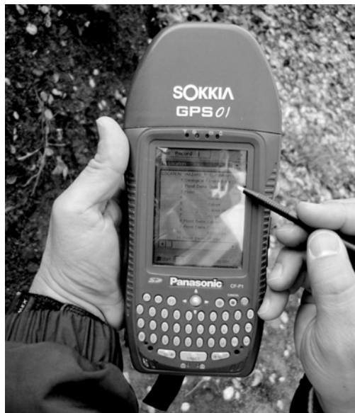
Figure 3. Jetstream equipped PDA for consistent field data gathering.

The ground survey teams employed ruggedized personal digital assistants (PDAs) equipped with integral global positioning systems (GPS) running the rapid development relational database engine Jetstream™ for consistent data gathering (Figure 3). Information was gathered on drainage features, surviving vegetation, hydrophobic soils, burn severity, receiving waters, infrastructure, and surviving homes. The PDAs were downloaded every night into a whole-project field data management system and correlated with the aerial and site photographs.