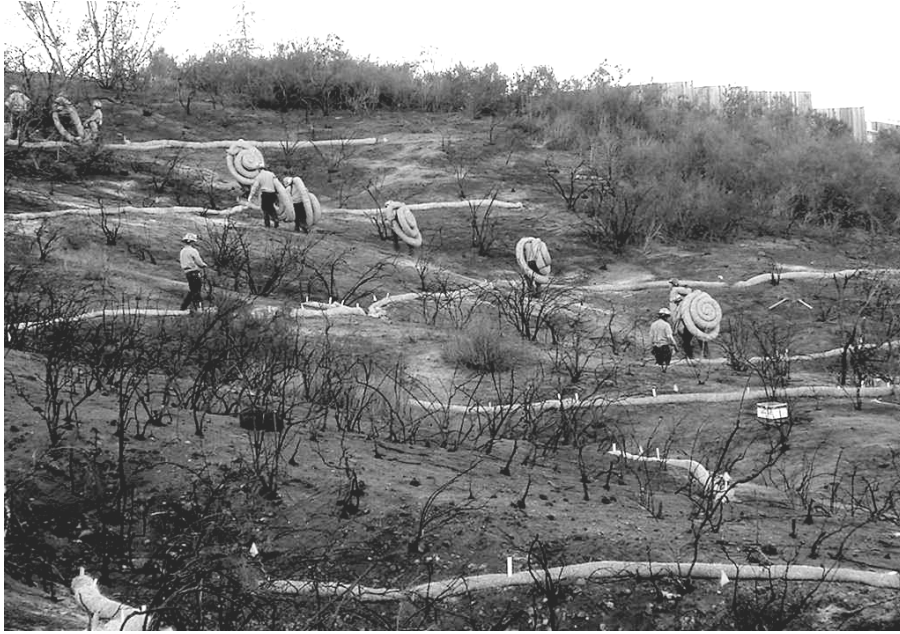
Figure 4. California Conservation Corps installing fiber rolls.