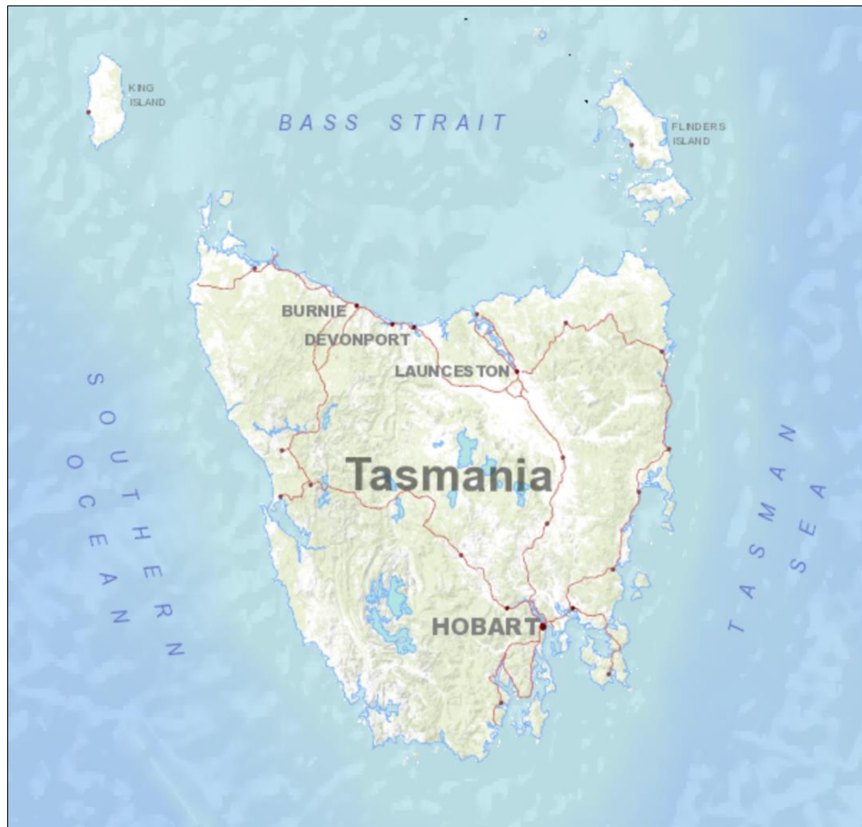
Figure 1 – Map of Tasmania

Earlier studies suggested that conducting only qualitative research methods such as interviews and focus groups have some limitations by inhibiting respondents emotions (Elliott and Jankel-Elliott, 2003) and respondents could be unwilling to reveal or admit their true motivations which could be considered "less socially acceptable" (Ashworth, 2004, p. 96). Quantitative research may be most familiar to physical scientists questions are answered based on the analysis of numerical data. Quantitative methods allow the researcher to measure cause and effect, determine statistically significant changes in variables, and look for correlations between variables. In quantitative studies, researchers first identify variables that may influence learning. Only one variable should change at a time during a study. Thus, researchers must carefully consider how to control for potentially confounding variables. Therefore, with a view