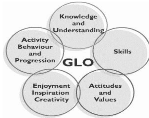
Figure 1. Generic Learning Outcomes (Hooper-Greenhill et al. 2003)

reliable results. Large numbers imply post-launch testing. Few institutions have the resources to test learning activities with large numbers prior to a public launch.