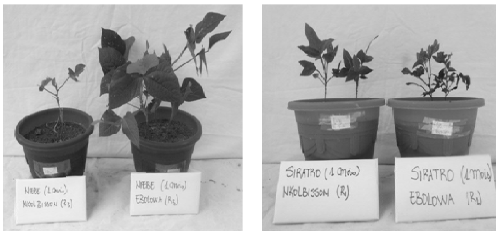
Fig. 1. Cowpea (niebe) and Siratro plants after one month growth.

Assays were performed in a greenhouse at the Experimental Station of the Institute for Agricultural Research and Development (IRAD) of Nkolbisson in the biological control and applied microbiology laboratory. An equivalent of 500g of soil sample per treatment was used as a source of inoculums for rhizobial extraction. The soil was mixed with sterilized (autoclaved at 121° C for 2 hours) sand (1:1 v/v) and added to sterile vessels (pots) with a capacity of 1000 g substrate. Pots were sown with 4 sterilized seeds of the trap plants and placed in greenhouse. The sterilization was performed by rinsing the seeds with 95% ethanol for 30 seconds, and with 0.2% sodium hypochlorite for 4 minutes and finally with sterile water to remove the hypochlorite solution. On the eighth day after germination, plants were thinned to two plants per pot. Plants were watered every morning with 500 ml of sterile water to facilitate their growth (Fig. 1). The vessels received every 2 weeks a solution containing all nutrients except nitrogen (Jensen, 1942). For each plant species and soil type (Al toxic soil, Mn toxic soil, control soil), three (3) replications were performed in a factorial completely randomized block design, giving a total of 18 vessels. The plants were harvested at early stages of flowering (approximately 60 days after the onset of germination) for rhizobial screening.