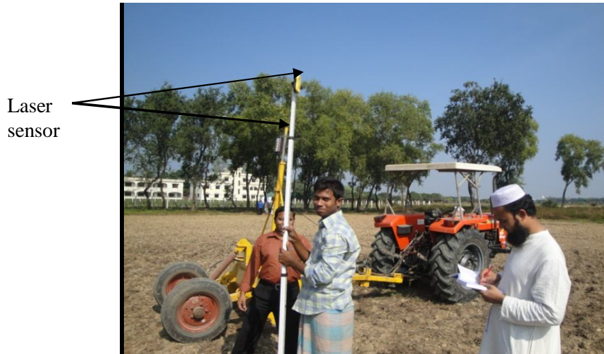
Fig. 2. Sensors in staff gage and the leveler