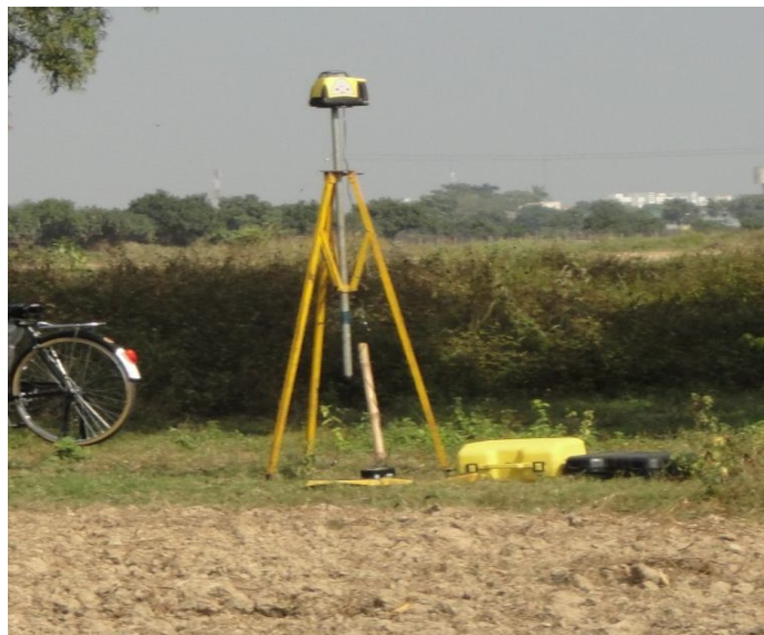
Fig. 1. Laser base station

The study was conducted at block no 6 of Bangladesh Agricultural Research Institute (BARI) field on clay loam soil during Rabi season of 2010-2011. The treatments consisted of Laser land leveling ( T_1 ) and Control (Non-levelled) ( T_2 ). In treatments T_1 and T_2 , leveling of experimental field was done as per treatment and information on the topography of each experimental unit was compiled. The net plot size of each treatment measured was 60 \times 22 \text{ m}^2 . A preliminary field survey was done using staff gage. Initially a base station was established to dispense laser ray uniformly as shown in Fig 1. It was a battery operated device, which covers a command area with 500 m radius. The laser ray erected from base station guides the sensor of the staff gage and the leveler (Fig. 2). Elevation data was collected from the different points of the field as located in Fig. 3. From the elevation data, an average elevation was fixed for the leveler to operate automatically.