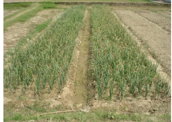
Fig. 3. Onion field seeded by the seeder, Gazipur

In 2009-2010, the seeder was tested after fabrication in experimental plot, BARI, Gazipur. In 2010, a drug chain was incorporated to