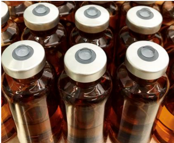
Figure 2 Vial septum seals with 0.1 ml of microbial test suspension on the needle insertion zone

The needle insertion zone of the vials was the 'ribbed' area of approximately 4 mm diameter (12.6 mm 2 surface area), on the outer exposed surface of the septum seals, and these were equally contaminated with 0.1 ml of each of the six test suspensions. The six test suspensions included the two types of test organisms at each of the three concentrations. The septum seals, contaminated with the test suspension prior to drying, are shown in Figure 2. The test suspensions on the septum were then left in the Class II microbiological safety cabinet for 90 minutes to completely dry.