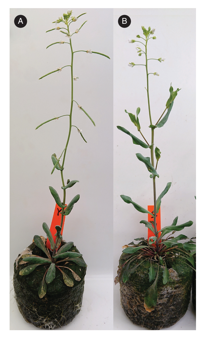
FIG. 5. Eutrema salsugineum. Eutrema salsugineum plants of the Yukon (A) and Shandong (B) natural accessions.

To do so, E. salsugineum has evolved several morphophysiological mechanisms: stomata in E. salsugineum leaves are present at higher density when compared to those of A. thaliana, but their conductance is lower and they respond to salt stress by closing more tightly, leading to lower transpiration rates (Inan et al., 2004). The leaves are also more succulent-like, with a second layer of palisade mesophyll cells, and they are frequently shed during extreme salt stress (Inan et al., 2004). The roots develop additional layers of endodermis and cortex cells in order to restrict ion movement towards the vasculature, thereby limiting salt uptake during salt exposure (Inan et al., 2004). Curiously, germination is actually impaired in E. salsugineum when grown on high-salt medium, compared to A. thaliana, probably to delay germination during unfavourable conditions (Inan et al., 2004). In addition to this increased salt tolerance, E. salsugineum also has a higher cold tolerance, being able to survive a cold shock of -15 °C, and is also more tolerant to phosphate starvation (Inan et al., 2004; Velasco et al., 2016).