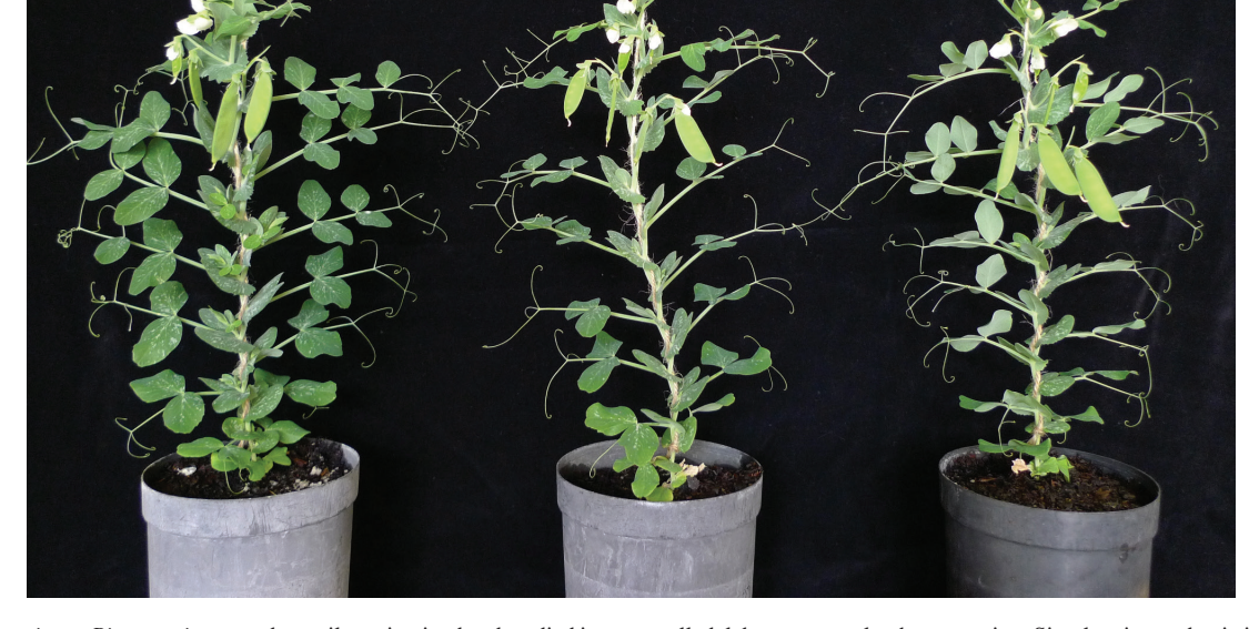
FIG. 7. Pisum sativum. Pisum sativum can be easily maintained and studied in a controlled, laboratory or glasshouse setting. Simple tying and twisting of the plants as they grow allows for easy comparison of their physiology.

pods, allowing fruit and seed to be left to desiccate on the plant and easily collected (Weeden et al. , 2002). Pea has a significant advantage over typical lab models such as A. thaliana , or fieldsuitable models such as maize, as pea is suitable for growth in the field, glasshouse, growth chambers and tissue culture environments.