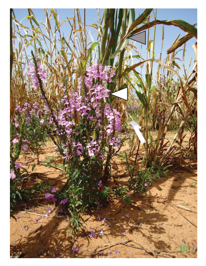
FIG. 4. Striga hermonthica. Mature St. hermonthica (white arrowhead) next to its host plant (grey arrowhead).

consisting of 4-7 weeks below ground, 4 weeks from emergence to flowering, and 4 weeks to seed maturation. Striga hermonthica produces a high number of seeds (up to 42 000 per plant) that remain viable for over 20 years, and its attachment to host plants can be carried out in the lab in rhizotrons, as well as on agar plates (Doggett, 1987; Berner et al., 1995; Yoshida and Shirasu, 2009; Mohamed et al., 2010). Furthermore, because St. hermonthica is able to invade established plant models, such as rice, maize and sorghum, mutant and natural variation collections from these crops can be exploited to analyse potential mechanisms of resistance (Cissoko et al., 2011; Mbuvi et al., 2017). The model eudicot A. thaliana is also susceptible to St. hermonthica, but the parasite fails to invade the vessel elements; therefore, it may be used to study vessel element resistance and help to differentiate between attack and actual infection (Yoshida and Shirasu, 2009). Furthermore, as some Striga species, such as St. hermonthica, are cross-fertilizing, whereas others are self-fertilizing (e.g. St. asiatica), parasitic invasion strategies can also be studied in a context of adaptation and speciation (Safa et al., 1984).