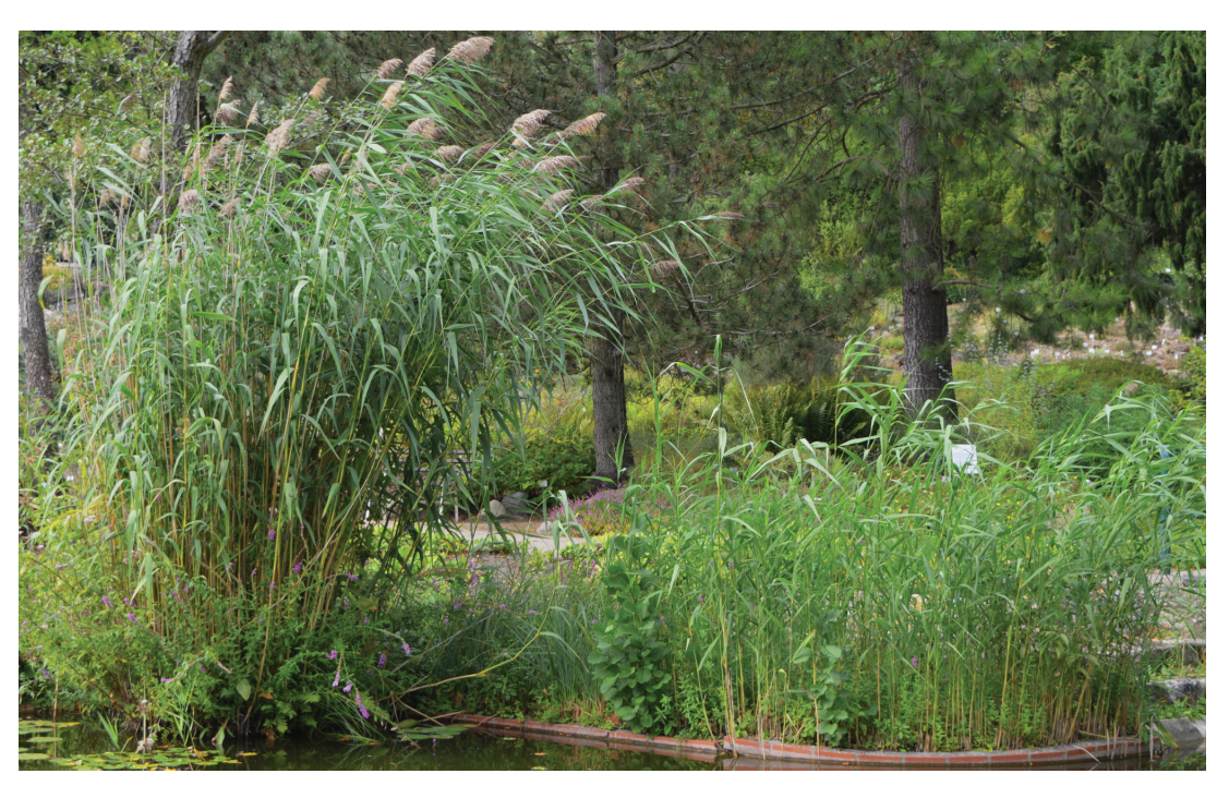
FIG. 3. Phragmites australis. A mature, flowering stand of Ph. australis (left) growing next to immature plants (right).

native to North America (Saltonstall, 2002). Furthermore, by analysing variable nuclear markers, high rates of genetic diversity were found among the invasive European 'M' haplotype across North America, suggesting a series of multiple introductions from Europe (Kirk et al. , 2011; Plut et al. , 2011). A second European haplotype, referred to as 'L1', was identified among two stands in Quebec, Canada, although whether it is invasive was not confirmed (Meyerson and Cronin, 2013). As there are 14 European haplotypes, it is important to investigate the differing traits between M and other haplotypes, to understand the factors that give rise to its invasive nature.