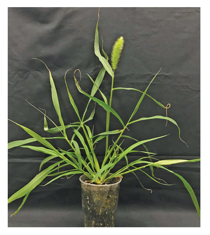
FIG. 2. Setaria viridis. Representative picture of Se. viridis, an emerging model for C_4 grasses.

reduced vegetative branching, synchrony of flowering and loss of seed dormancy. These differences are thought to be part of the 'domestication syndrome' caused by artificial selection made by humans during foxtail millet domestication (Li and Brutnell, 2011). Regarding its photosynthetic apparatus, Se. viridis is a C<sub>4</sub> plant employing an NADP-dependent malic enzyme (NADP-ME subtype) as the decarboxylating enzyme located in the bundle sheath, similar to important food and bioenergy crops such as maize, sorghum and sugarcane (Danila et al. , 2016). These facts make Se. viridis an excellent model for studying plant domestication, to understand the molecular mechanisms underlying several aspects of C<sub>4</sub> photosynthesis and to validate biotechnological strategies aimed at boosting plant yields.