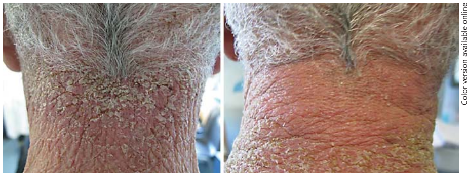
Fig. 5. Papulopustular rash before and after topical therapy.

cancer patients at the Section of Dermatology, Department of Clinical Medicine and Surgery, University of Naples Federico II (fig. 4). The patients' data were registered using a software set up specifically to record general information, tumor grading, type of chemotherapy, and skin manifestations.