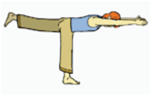
Fig. 1. Schematic view of the motor task

a marked area designated as the balancing area in this study. Participants then performed one trial as a pretest without any attentional focus instructions. Then, they engaged in the acquisition phase over five training blocks with each consisting of three minutes of training on the balance task. The participants were given a two-minute resting time between each training block. One day later, the children performed a one-trial retention test without any attentional focus instructions. In the pretest and the retention test, the children were instructed to balance as long as possible. In the external focus condition, the children were instructed to “focus on the yellow marker” that was placed two meters ahead of them on the ground. In the internal focus condition, the children were instructed to “focus on the right leg” while balancing. In the retention test, there were neither attentional focus instructions nor a yellow marker on the ground. To ensure that the children followed the focus instructions, we reminded them orally on how to focus at 10-second intervals during the training block. In order to measure the type and intensity of focus the participants applied, we had all children perform a manipulation check following the training phase. To determine the type of focus, we asked “what did you focus on?”, and to measure intensity of focus, we asked them to indicate on a Likert scale from 1 (not at all) to 7 (very much) “how much did you focus on it?”