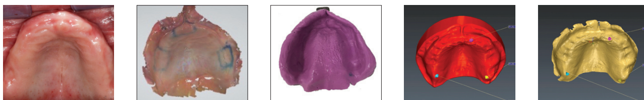
FIG. 2 Digitization of edentulous jaws.

tray selection, separation of impression material from the impression tray, distortion of conventional impressions before pouring and storage of conventional impressions for potential remaking of casts (1, 2). Furthermore traditional impression has been perceived by patients as an uncomfortable treatment experience (3, 4), in particular for sensitive subjects, such as children and patients with a strong gag reflex (5). In addition, it can be difficult with some impression materials, like for example polysulphides, to remove any excesses from adjacent surfaces or clothes.