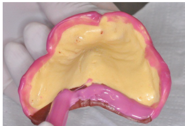
FIG. 1 The conventional impression tray also records peripheral areas such as oral vestibule and soft palate.

To obtain an acceptable retention it is important, in the second impression, to register the muscles's function and to edge the impression tray in the peripheral areas (namely oral vestibule and soft palate) with the purpose of giving a selective pressure in order to obtain a particular effect, also known as "suction effect" (Fig. 1). Problems observed with conventional impressions include soft-tissue management, improper impression