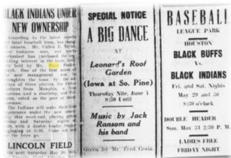
Sports Column highlighting the change in ownership of the San Antonio Black Indians Baseball Team. ( San Antonio Register, “Black Indians and Players,” Friday, May 29, 1931.)