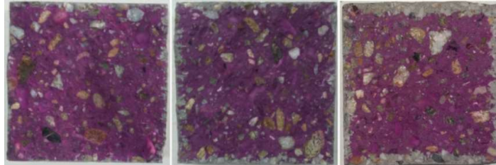
Figure 2. Carbonation depth at 4% \text{CO}_2 concentration and at the age of 7, 14 and 28 days

Having this in mind, a conclusion can be made that a linear relationship between the carbonation depth and square root of time ( t^{0.5} ) was not appropriate for HVFAC. Instead, functions considering t^{0.75} as a parameter showed a much better correlation with measured results, Figure 1 (right). Coefficient of determination in this case for all \text{CO}_2 concentrations ranged from 0.900 to 0.976.