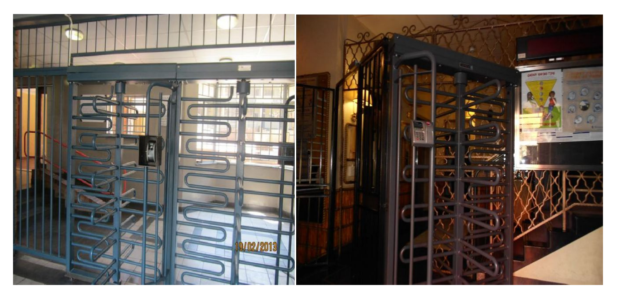
Image 1: Entrances to social housing buildings, Hillbrow