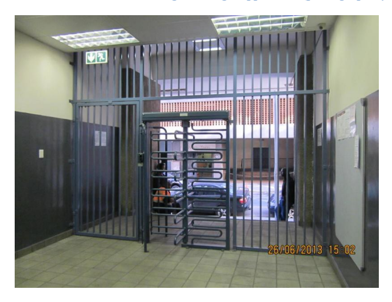
Image 2: Entrance to a communal housing building, Jeppestown