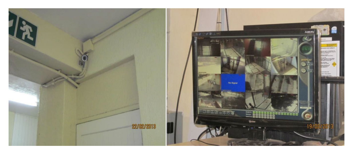
Whilst these arrangements appear draconian, residents tend to welcome them and point them out as the features they are most enthusiastic about. However, housing companies also use security to regulate their tenants and create restrictive environments. The numbers of people living in apartments are tightly controlled and housing companies (both social and for-profit) do not allow guests to stay overnight without pre-arranged permission. Whilst this access control is generally welcomed by tenants, it can also restrict their abilities to assist friends or family members who need temporary places to stay and is at odds with the fluid circumstances of many people living in the inner-city (see Mayson and Charlton, 2015).