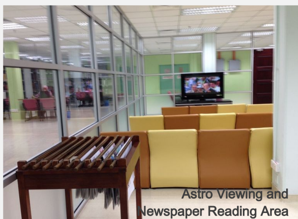
Astro Viewing and Newspaper Reading Area