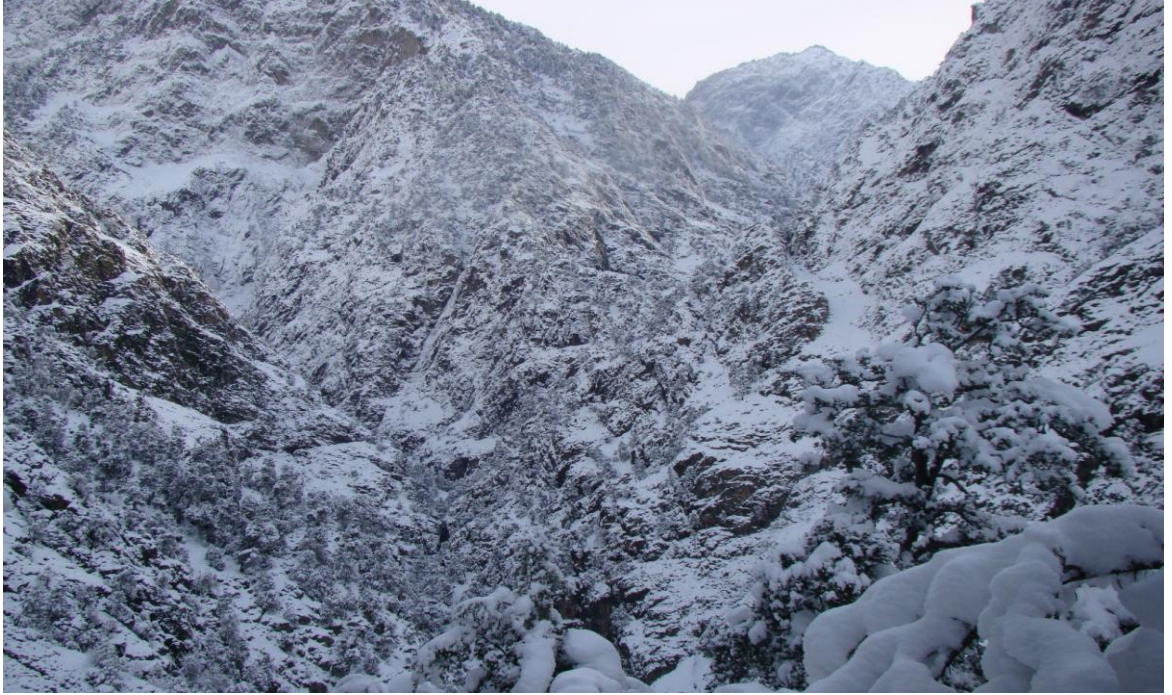
Plate 1.3: Typical Markhor Habitat in Kaigah valley Kohistan during winter