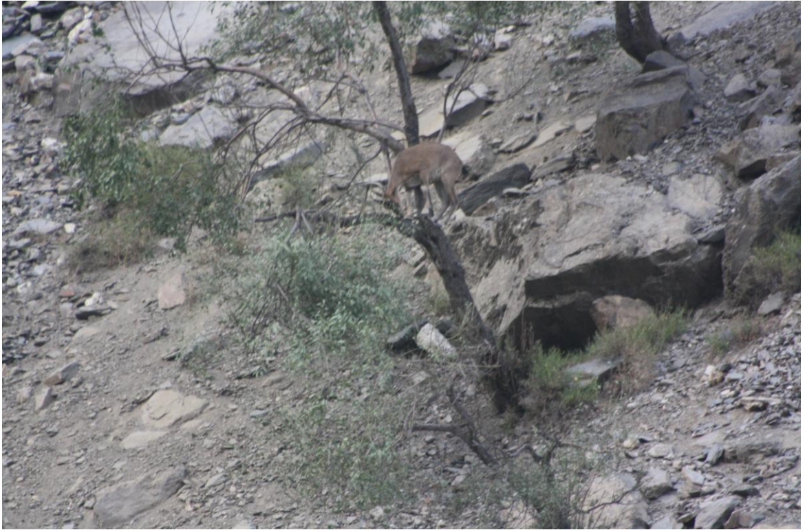
Plate 1.1: Markhor browsing on foliage of oak tree.