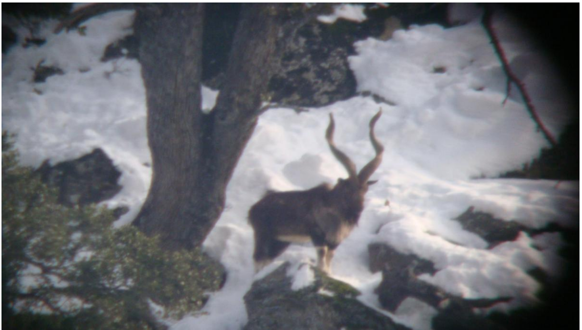
Plate 1.2: Capra falconeri cashmiriensis (Adult male – January 2012)