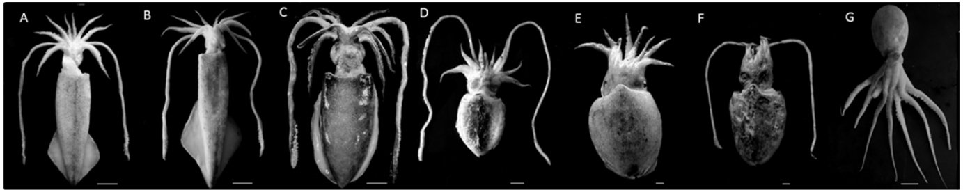
Fig 4. Species of cephalopod (A) U. (P.) edulis , (B) U. (P.) chinensis , (C) S. lessoniana , (D) S. recurvirostra , (E) S. inermis , (F) S. aculeata , and (G) C. indicus (scale bar 5 cm)