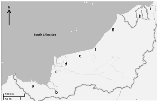
Fig 1 Map showing the collection sites (a-i) of Sarawak, Malaysia. (a) Kuching, (b) Sri Aman, (c) Sarikei, (d) Sibü, (e) Mukah, (f) Bintulu, (g) Miri, (h) Limbang and (i) Lawas