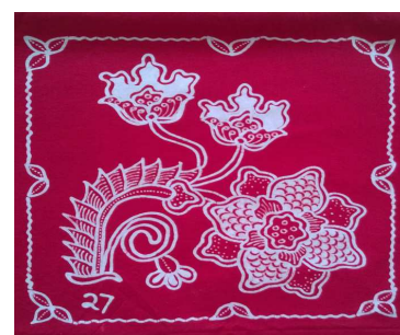
Fig. 3 Batik fabric prototype that uses batik wax W2