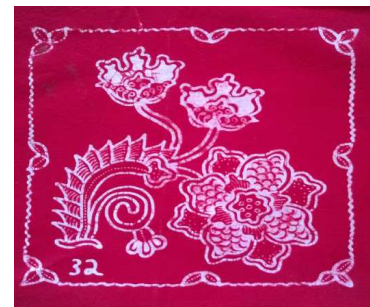
Fig.12 Batik fabric prototype that uses batik wax W11