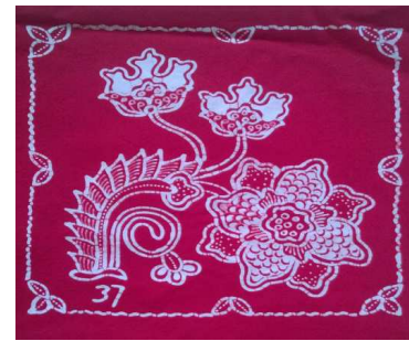
Fig. 9 Batik fabric prototype that uses batik wax W8

In Fig. 6-9 appears the batik fabric prototype manufactured with batik wax W5-W8. Based on visual in Fig. 6-9 seems that batik fabric prototypes produced by using batik wax of this category have good quality. It is proved by undetectable cracks on the motives, although current the cracks on the motives has been widely used as a new innovation in the production of batik fabric.