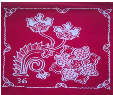
Fig. 8 Batik fabric prototype that uses batik wax W7