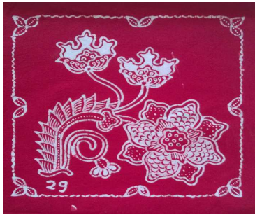
Fig. 5 Batik fabric prototype that uses batik wax W4