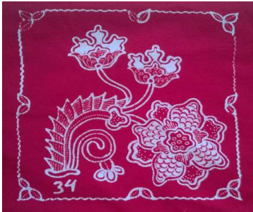
Fig. 6 Batik fabric prototype that uses batik wax W5

In Fig. 6-9 appears the batik fabric prototype manufactured with batik wax W5-W8. Based on visual in Fig. 6-9 seems that batik fabric prototypes produced by using batik wax of this category have good quality. It is proved by undetectable cracks on the motives, although current the cracks on the motives has been widely used as a new innovation in the production of batik fabric.