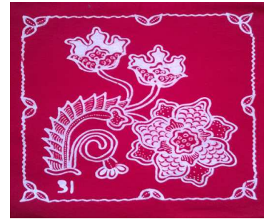
Fig. 11 Batik fabric prototype that uses batik wax W10