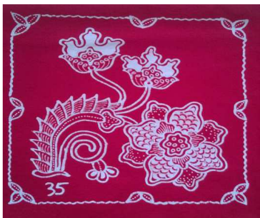
Fig. 7 Batik fabric prototype that uses batik wax W6