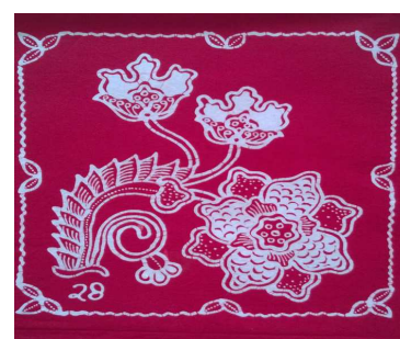
Fig. 4 Batik fabric prototype that uses batik wax W3