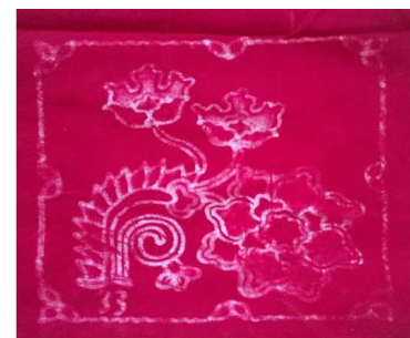
Fig. 13 Batik fabric prototype that uses batik wax W12

The application stage of batik wax W1-W12 is expected to become the embodiment of the direct invention of the research results by the perpetrators of batik business. More specific, this stage aims to know the difficulty level of batik