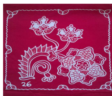
Fig. 1 Batik fabric prototype that uses batik wax W1

Visualization of batik fabric prototype manufactured a product with batik wax W1-W4 increasingly supporting the laboratory scale research data that has already been done before, where the quality of the resulting colors and motives in batik fabric prototype does not indicate the presence of cracks and the occurrence of color on the motive that are not supposed.