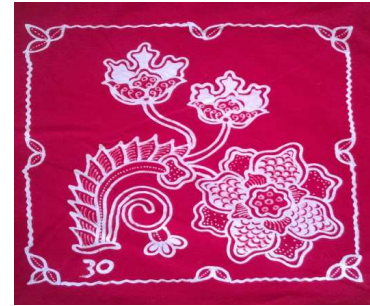
Fig. 10 Batik fabric prototype that uses batik wax W9