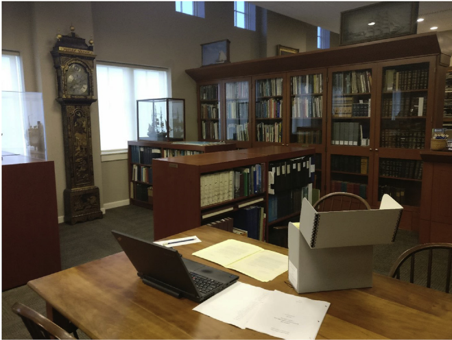
Fig. 3. Grimshaw-Gudewicz Reading Room, New Bedford Whaling Museum, New Bedford Whaling Museum Research Library, New Bedford, MA. May 31, 2017, Author's own.

general ephemera. Buried among these are a series of letters which relate to her travel to Europe in 1921 to attend the Second Pan-African Congress in London, Brussels and Paris as a translator and interpreter. In our final case study, we explore how this small collection of family papers can yield fresh perspectives on the history of twentieth-century internationalism.