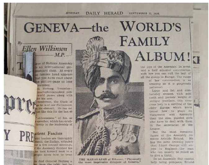
Fig. 2. Geneva – the World's Family Album, Daily Herald , September 22nd, 1930. Reproduced with the permission of the Maharaja Ganga Singhji Trust.