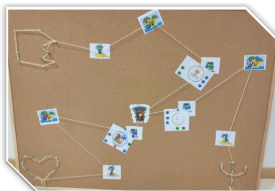
Figure 1. A simplified gamified process map.

The final mission of the experience was to get to the pencil throne, where they would compete in a final game for the throne. All groups had the same opportunities to obtain the highest grade and to use the obtained rewards. These rewards could be exchanged for more time to respond, to be able to speak before peers, etc.