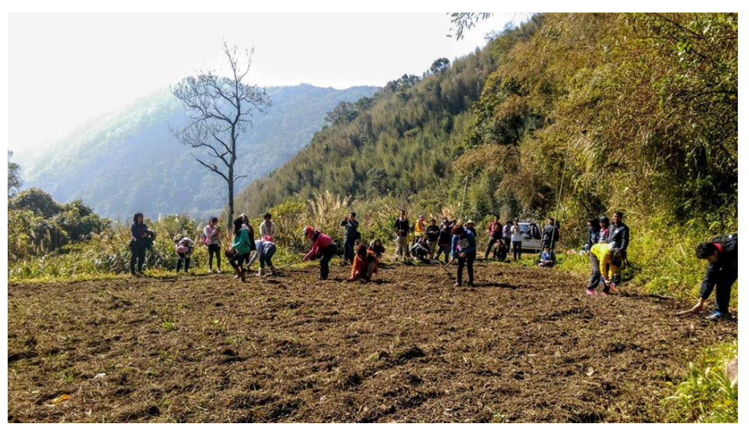
Figure 3. Building "the Ark of Millets" in the Indigenous Tayal communities in Taiwan involves working in the field as a collective. It is not just labor, but a collective healing, reconnecting, reconciliating and assembling of a multi-sensory aesthetics.