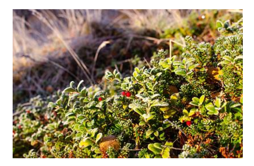
Figure 1. Berries on the fells of Sápmi. The diversity of all living organisms and the diversity of our social and cultural lifeworlds need to be protected and valued if we wish to foster sustainability.

Cultural sustainability can, however, only be accomplished by making sure not to favor some voices over others. This means listening honestly to solutions worked out in each context. It also means not to impose upon others dominant ideas about what sustainability is in the first place.