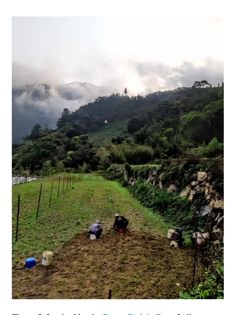
Figure 3. Inspired by the Potato Park in Peru, Indigenous communities in Taiwan have started to store millet seeds. They have named it "the Ark of Millets". The Ark is a form of sustainable food production that includes also cultural and social sustainability for the community.