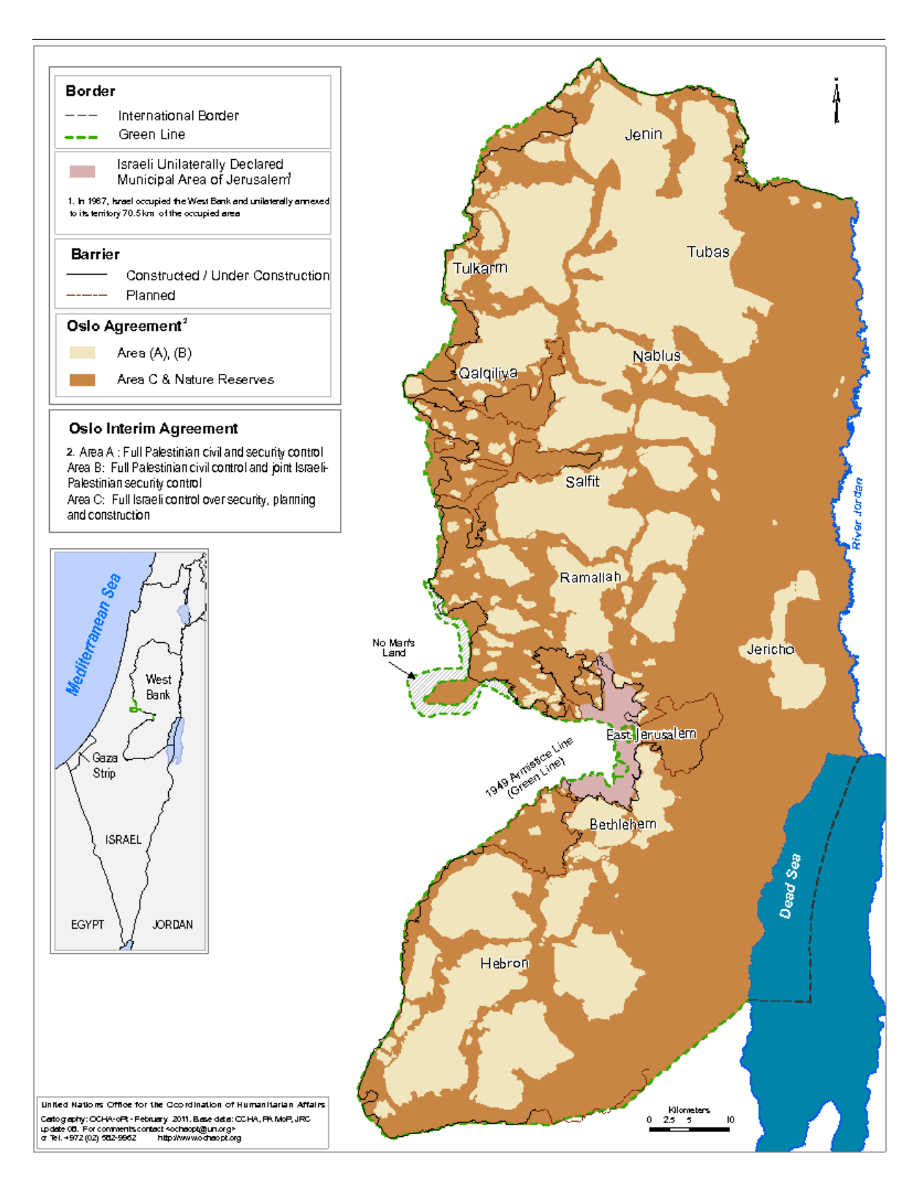
Map 2: The West Bank after the Signing of Oslo II Interim Agreement (Source: United Nations Office for the Coordination of Humanitarian Affairs).