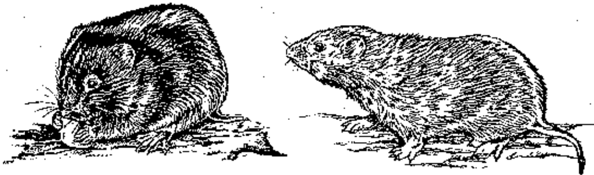
Figure 1. Montane vole, Microtus montanus (left), and Prairie vole, M. ochrogaster (right).

Voles occupy a wide variety of habitats, depending on the species. Generally, voles prefer areas with heavy ground cover of grasses, grass-like plants, or litter. When two or more species inhabit an area, they generally occupy different habitats. Voles can be found in orchards and cultivated fields. They are active both day and night and throughout the year. Voles eat a variety of plants and animals. They frequently forage on grasses, forbs, roots, bark, snails, and insects. To find food, voles construct tunnels and surface runways with many burrow openings (Figure 2). Several adults and young can live in these runway systems. This intricate network of tunnels and