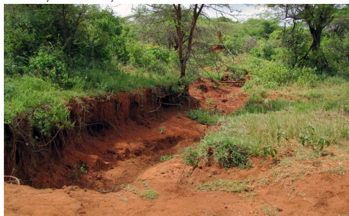
Gully erosion is the culmination of many years of over-grazing by livestock. Restoring the rangeland and implementing improved grazing management practices needs to occur, or the productivity of the system will irreversibly decline.