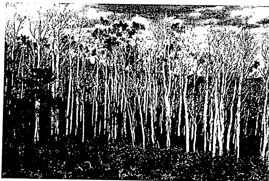
Figure 3.—Abundant regeneration of aspen 3 years after herbicide spraying.