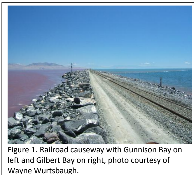
Figure 1. Railroad causeway with Gunnison Bay on left and Gilbert Bay on right, photo courtesy of Wayne Wurtsbaugh.

metric tons, until pumping to the west desert in the mid-1980s reduced it to 4.5 billion tons. Without the causeway, we estimate that the "whole" Great Salt Lake salinity would have exceeded the tolerance of brine shrimp in 73% of the years between 1960-2011 (Figure 2B). The fresher Farmington and Bear River Bays would likely have supported brine shrimp during those years, but nevertheless, "whole" lake production would likely have been lower than what actually occurred in Gilbert Bay with the causeway. During those drier years with the causeway, Gilbert Bay had acceptable salinities and supported brine shrimp, brine flies, and the bird community dependent on these prey species. In the very wet years of the mid-1980s, Gilbert Bay became too fresh to support large populations of brine shrimp. Then Gunnison Bay, which at that time was less saline from heavy precipitation, supported brine flies and shrimp (as well as brine shrimp cyst harvesters).