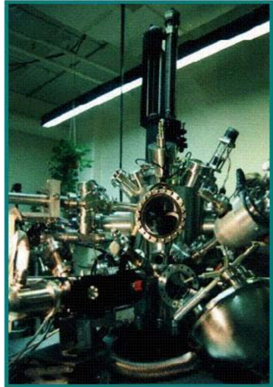
Fig. 2. USU electron emission test chamber where Faraday cup testing will be conducted.