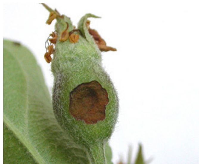
Fig. 2. Apple fruitlet injured by fruitworm feeding.

The speckled green fruitworm generally does not cause serious damage, though high densities can cause localized defoliation. The larva (Fig. 1) feeds on flowers, leaves, and fruit. Feeding damage to early-season fruit, such as young apples and cherries (Fig. 2), results in severe malformation of the mature fruit (Fig. 3). Beat-samples (shaking or banging limbs over a light-colored tray) are a good way to determine if fruitworm larvae are present.