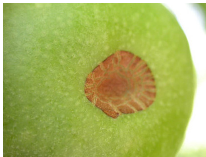
Fig. 3. Mature apple with fruitworm injury.