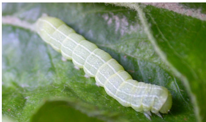
Fig. 1. Speckled green fruitworm larva.

In Utah, the speckled green fruitworm (Order Lepidoptera, Family Noctuidae) is a common pest of fruit trees. The larvae (caterpillars) hatch in spring and begin feeding on buds, flowers, leaves and young fruit. The larvae can also feed on a variety of ornamental trees, such as willow, birch, poplar, alder, and maple.