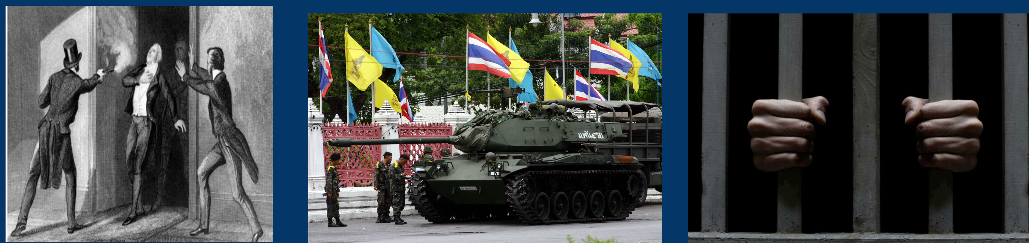
Figure 1 – Sometimes less acceptable ways of gaining power are used such as assassination, coup, and imprisonment.

This finding may suggest strategic considerations regarding power structures developed to prevent singular domination, such as a democratic government. There are no stable PCD's that have 3 or 4 objects. The smallest stable PCD contains 5 objects. Suggesting that a stable democratic government should be built on 5 branches rather than 3.