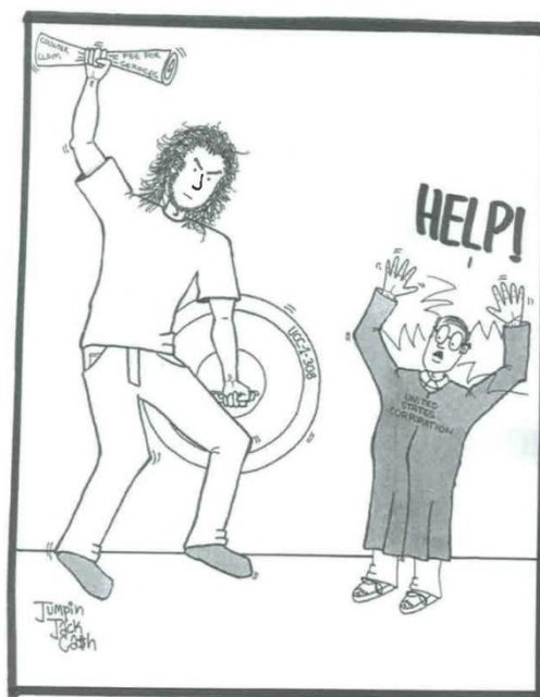
Figure 1- Comic of a Sovereign reclaiming dominance over the U.S. government (or corporation). 82

influence of the groups' perceptual lens. As they take back what they see as their proper place in the United States, Sovereigns become more powerful than officials.