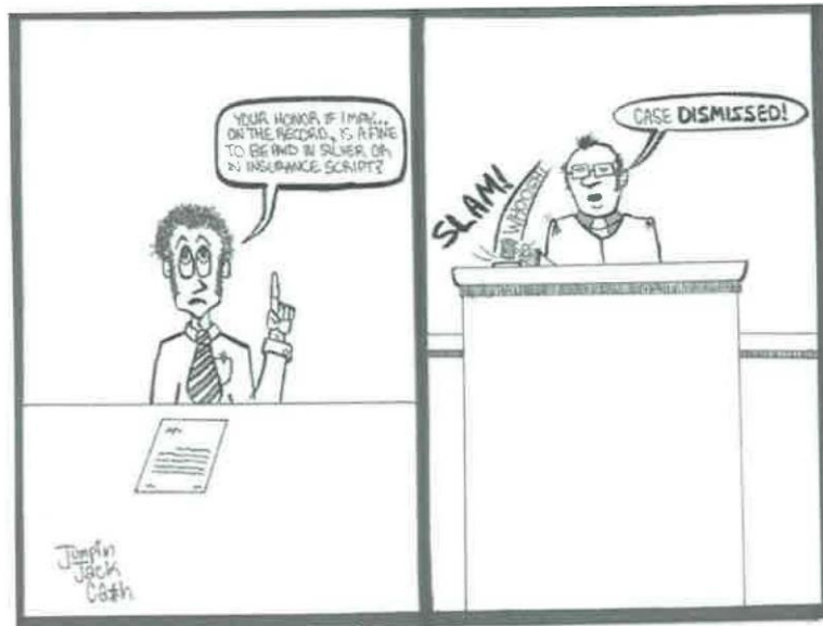
Figure 3- Comic evidence that Sovereigns are successful in court. 113