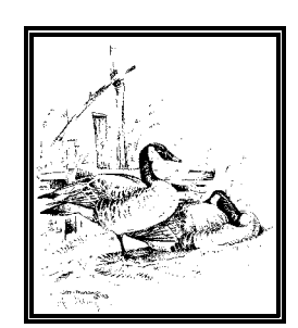
The Berryman Institute

Utah Division of Wildlife Resources 1596 West North Temple Salt Lake City UT 84116-3154 (801-538-4700)