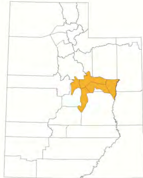
Figure. 3. The Castle Country Adaptive Resource Management (CaCoARM) Sage-grouse Local Working Group Conservation Area consists of 1,906,443 acres located in eastern Utah.

http://utahcbcp.org/files/uploads/carbon/CaCoARM_final-01-07.pdf