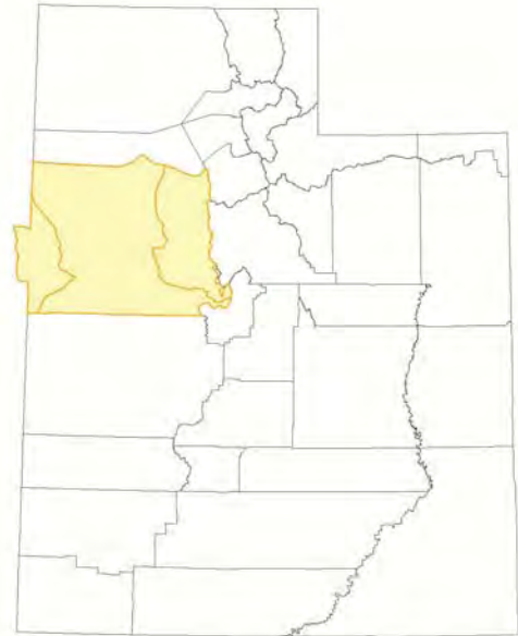
Figure 11. The West Desert Adaptive Resource Management (WDARM) Sage-grouse Local Working Group Conservation Area consists of 5,137,991 acres located in western Utah.

This is particularly important in an area where substantial fire and fuel management projects intersect sage-grouse habitat. WDARM members have increased the depth of coordination between multiple entities as well: based on information provided to the group by a private landowner in attendance at the group meeting, a plan to address weed concerns near one of the leks was developed with shared leadership and resources from BLM, Tooele County Commission, weed managers from NRCS, and DWR. WDARM also stepped up its efforts to better understand the social and ecological complexity of recreation impacts to sage-grouse habitat. This will be a focus in the coming year.