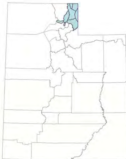
Figure 7. The Rich County Coordinated Resource Management (RICHCO) Sage-grouse Local Working Group Conservation Area consists of 661,760 acres located in north-eastern Utah.

This information below summarizes efforts made by individual and partners to address threats and strategic actions for the Rich County Greater Sage-grouse Local Conservation Plan and by the USFWS (2010). This adaptive plan is in effect until the year 2016. RICHCO partners not only reported on specific actions completed or addressed in 2009-2010 but also identified steps to be taken to implement additional actions into subsequent years of the plan. In 2011, RICHCO and USU received funding through the NRCS SGI to begin a multiple year evaluation of the relationship between rotational and season-long livestock grazing and sage-grouse vital rates and habitat-use patterns. This will involve comparing sage-grouse vital rates and habitat-use on Desert Land and Livestock (DLL, rotational grazing) to the BLM Three Creeks Allotment (seasonlong grazing). The Three Creeks Allotment Project is discussed in detail below. For the complete list of threats identified by the RICHCO group, see page 64 of the conservation plan located on line at http://utahcbcp.org/files/uploads/rich/RICOSAGRPlan_Draft1.pdf