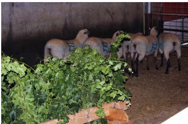
Figure 5. Testing the aversion. After these sheep ate grape leaves, they were dosed with LiCl. They are no longer interested in eating grape leaves.

5 minutes (Figure 5). Some sheep may take a few bites, but they shouldn't eat any more than 5 to 10 bites. Any animal that eats more than 10 bites should be re-dosed with LiCl. If you're uncertain whether some sheep should receive another dose of LiCl, you can encourage them to eat more of the target food by placing them in a pen with sheep that readily eat the target plant. The partially averted sheep will likely be encouraged to eat more of the target plant when it sees other sheep eating the same food. If they eat more of the plant they can be re-dosed with LiCl.