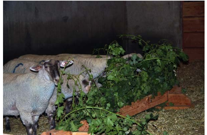
Figure 3. Sheep eating a novel food, grape leaves.

training is delayed until late-morning or mid-day, the sheep may not be interested in eating the target plant, especially those sheep already reluctant to eat the target plant. Conduct the training on small groups of animals, 5 to 10 individuals, depending on the number of people you have to help. Place the first group of sheep in a pen with the target plant, for 5 to 15 minutes. The more they eat the better, but any amount over 20 bites is adequate (Figure 3).