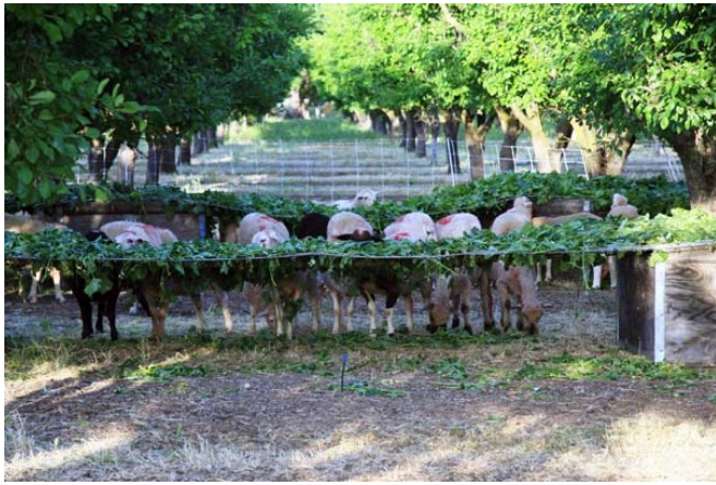
Figure 9. Exposing a large group of sheep to grape leaves.

Consumption of grape leaves in both groups appeared adequate, although consumption by a few individuals in each group was low. LiCl solution was administered to the sheep with a drench gun immediately after consuming the grape leaves. Using this method, four people were able to process 200 sheep in about 1 hour. All the sheep, verified by a test later the same day, achieved a surprisingly strong aversion to grape leaves and vineyard grazing began the following day.