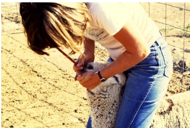
Figure 4. Dosing an animal with a capsule of LiCl using a balling gun.

5 minutes (Figure 5). Some sheep may take a few bites, but they shouldn't eat any more than 5 to 10 bites. Any animal that eats more than 10 bites should be re-dosed with LiCl. If you're uncertain whether some sheep should receive another dose of LiCl, you can encourage them to eat more of the target food by placing them in a pen with sheep that readily eat the target plant. The partially averted sheep will likely be encouraged to eat more of the target plant when it sees other sheep eating the same food. If they eat more of the plant they can be re-dosed with LiCl.