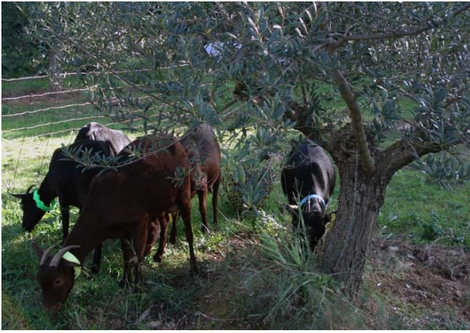
Figure 14. After training, goats avoid olive tree leaves and graze forage under trees.

Researchers in Spain used a different set up to test the strength of an aversion to grape leaves of conditioned sheep (Figure 15). Sheep readily grazed the grape leaves (Figure 16) at first, but after receiving LiCl sheep were successfully used as weeders in the vineyards (Figure 17).