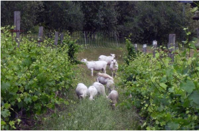
Figure 7. Grazing vineyards gives sheep producers another source of forage.

or fertilizers are used, and biodynamic production, a system that builds on the organic philosophy with additional natural and holistic management practices. Conventional farmers may want to look at using trained sheep for vegetation management.