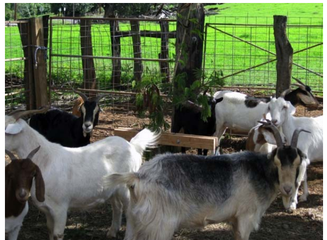
Figure 11. Goats avoid Tarramba after receiving LiCl.

Friel and Brooks were so impressed with the persistence of the aversion; they