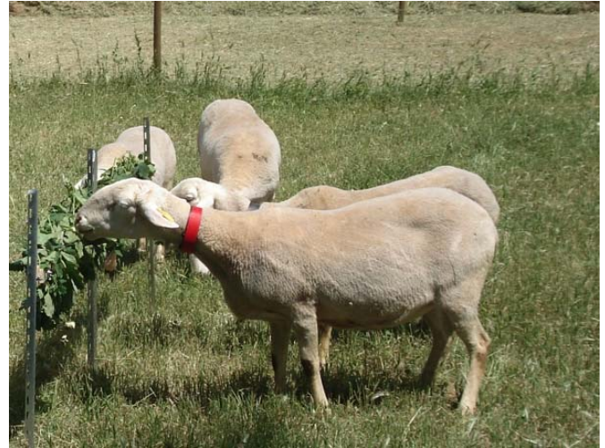
Figure 16. Sheep not averted to grape leaves readily eat them.

During the study, sheep were trained to avoid two shrubs, mountain mahogany and serviceberry.