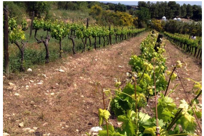
Figure 17. After grazing vineyards using sheep conditioned to avoid grape leaves.

Researchers demonstrated that sheep could be taught to avoid the shrubs, but continue to eat the grasses and forbs in the understory to promote shrub growth (Burritt and Provenza, 1989) (Figure 18). Further study showed the aversion lasted for at least a year (Burritt and Provenza, 1990). Sheep were successfully used as weeders for several years at the site.