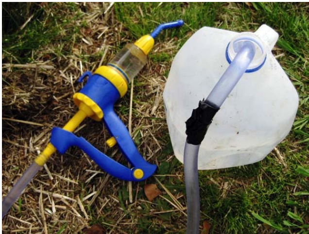
Figure 2. Drench gun use to dose animals with the LiCl solution.

6. Drench gun/syringe (Figure 2) OR gelatin capsules and a balling gun, depending on preferred method of administration.