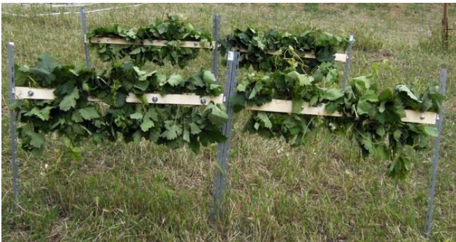
Figure 15. Frames used by researchers in Spain to test an aversion to grape leaves.

In the late 1980s, the first study at Utah State University to train sheep to avoid browsing a specific plant species was more than academic; it was practical.