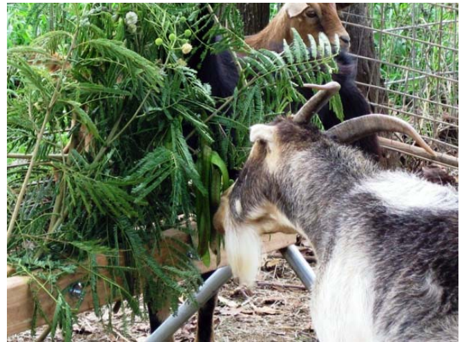
Figure 10. Goats eating the forage Tarramba.

In November 2011, they trained 30 goats to avoid Tarramba using aversive conditioning. Prior to training, goats were penned overnight without feed.