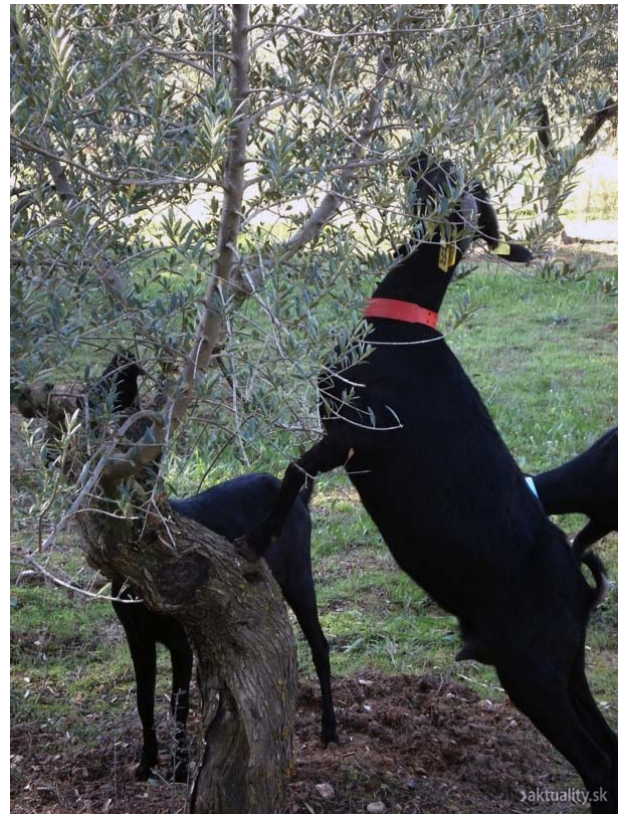
Figure 13. Goats readily eat olive tree leaves.

The project was conducted under commercial conditions. Sheep and goats acquired an aversion for olive leaves and sheep also learned to dislike grapevines.