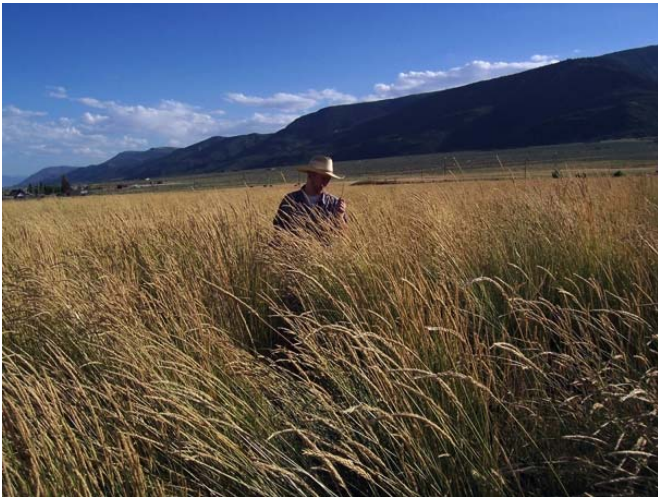
Figure 12. Russian wildrye grown for seed. Goats averted to the grass were used as weeders.

When grown for seed, Russian wildrye is planted in rows 3 feet apart leaving plenty of room for weeds such as bindweed, cheatgrass, bulbous bluegrass, lambsquarter, pigweed, fillaree, Russian thistle, and knotweed to grow. Hansen averted goats to the grass and reported that the goats ate the weeds and avoided the grass. They even ate the weeds in between the grass and wrapped around the grass (Figure 12).