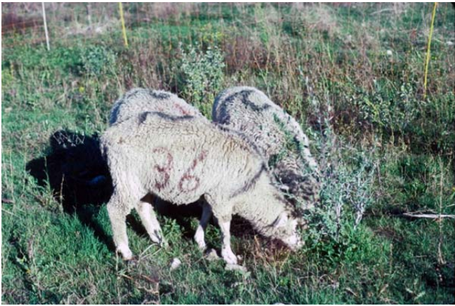
Figure 18. Sheep trained to avoid the shrub mountain mahogany weed research plots.

plant is novel; 2) use mature animals; 3) provide an ample supply of nutritious familiar foods; 4) don't allow trained animals to forage with animals that eat the target plant; 5) train animals where they will be used; and 6) provide animals alternative areas away from the target plant.