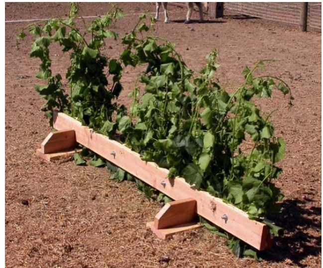
Figure 1. Forage clamp used to feed grape leaves.