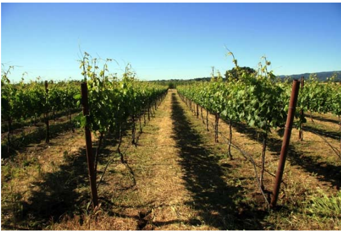
Figure 8. A vineyard after sheep grazing

In dry years, vineyards provide an additional food source for sheep (Figure 8). A tremendous amount of feed grows on the floor of a vineyard, so it gives a sheep producer an alternative feed source when traditional feed sources on the range may be low.