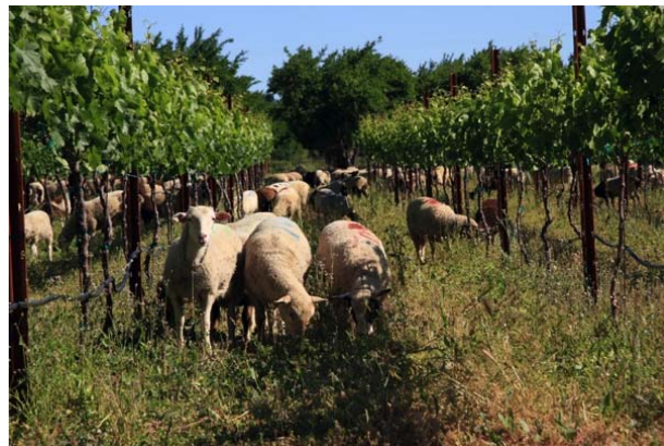
Figure 6. Sheep are working hard weeding a vineyard.

Trials conducted at Hopland, California, determined if sheep could be trained to avoid eating grape leaves, but eat the plants growing underneath and in between the grapevines (Figure 6).