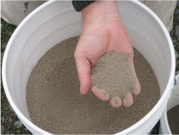
Figure 2. Struvite recovered from animal waste.

be separated from the wastewater and used as a slow release fertilizer (Adnan et al., 2003).